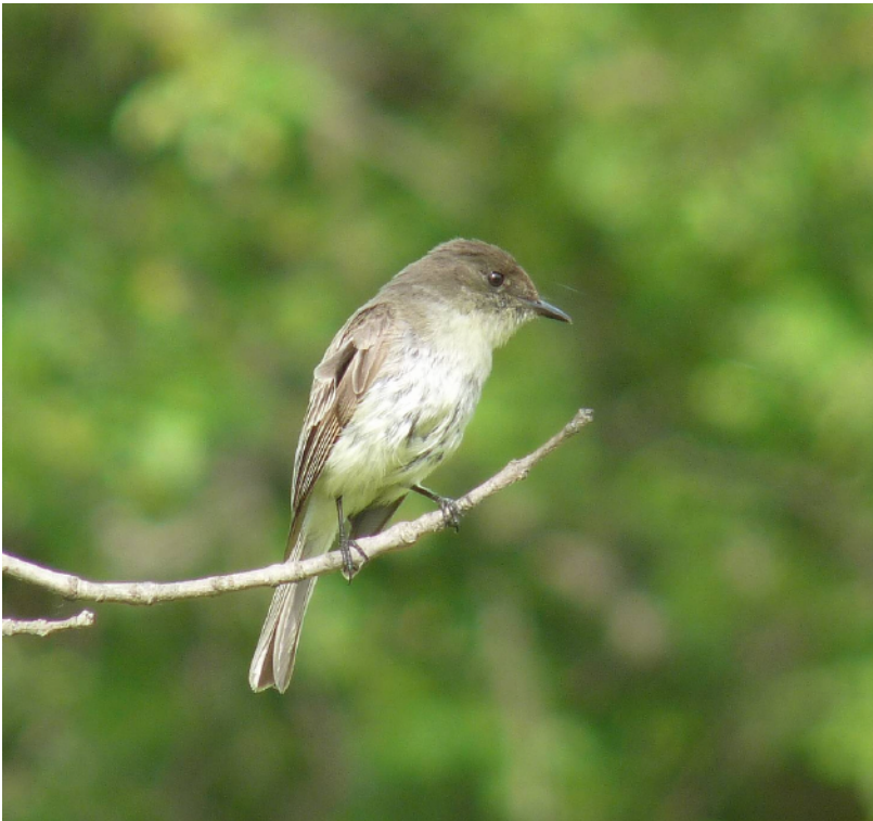
Eastern Phoebe (Left) Killdeer (Below)