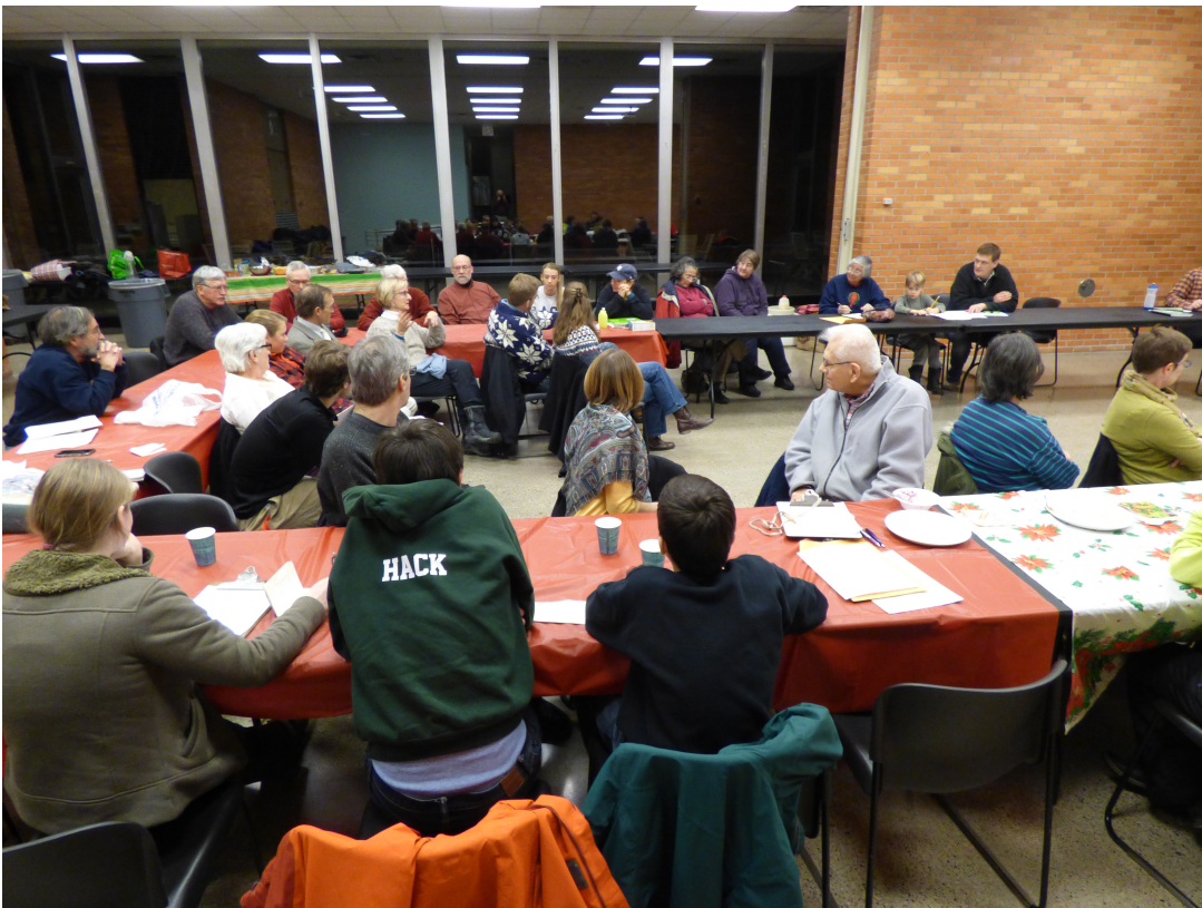
CBC participants at the potluck dinner at Matthaei Botanical Gardens.

In contrast to the depressed sparrow numbers, finches were present in good variety and numbers. Twelve Common Redpolls and two Purple Finches were the clear highlights, but the other three species were found in numbers well above average, as were House Sparrows.