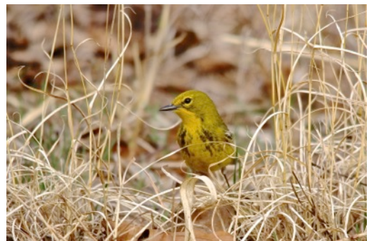
Pine Warbler, Benjamin Hack

American Robin, Black-throated Blue Warbler by Matty Hack Blackburnian Warbler, American Redstart by Benjamin Hack