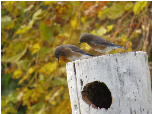
Eastern Bluebirds, Ann Arbor