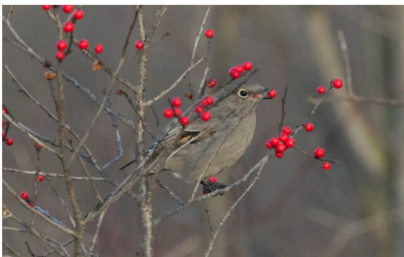
Townsend's Solitaire, Lyle Hamilton

If you'd rather not brave the weather (whatever it may be like on count day), there is always the option of staying indoors and pitching in as a feeder watcher. If you have a feeder within the count circle, this is a fun and easy way to participate. ( Remember: the feeder MUST be within the count circle, otherwise the data is invalid for our count—simply type your address into Google Maps to make sure, or check with me). Like field observers, you may sign up to participate for any length of time—from one hour to all day. Contact feeder watch coordinator Kurt Hagemester for more information, to sign up, or to get feeder watch forms.