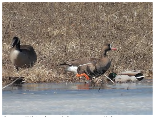
Greater White-fronted Goose Anser albifrons , Sharon Mills County Park, March 6 2021

In early March, the place to go for Tundra Swans was Four Mile Lake. They were present there every day from 3/6 through 3/15, peaking at a whopping 125 individuals on the 15<sup>th</sup>. Unfortunately, the birds were often on the far northern portions of the lake, making for some challenging viewing conditions. Away from Four Mile, there were a handful of observations of flyover flocks, from as few as nine or ten over Ypsilanti and Ann Arbor to as many as 200 over Chelsea on 3/9.