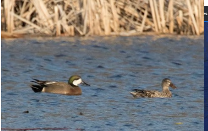
Northern Shoveler x Gadwall Spatula clypeata x Mareca strepera , Trinkle Marsh, March 30 2021 (Michael Bowen)

On 3/27, a weird-looking dabbling duck was found among the shovelers and wigeon at Trinkle Marsh – research online revealed that this oddball bird was most likely a hybrid of Northern Shoveler x Gadwall , a rare, but not unheard-of hybrid combination. This wonky bird appeared paired up with a female Northern Shoveler and was seen through 4/24. Generally the rarest of the dabbling ducks, Northern Pintails were found in more than a dozen locations throughout the county, with a maximum of 53 at Four Mile Lake on 3/9.