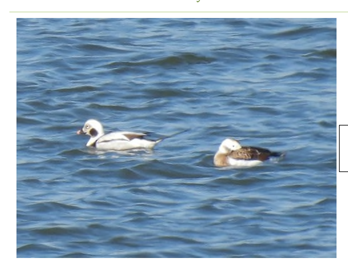
Long-tailed Duck Clangula hyemalis , Ford Lake, March 3 2021