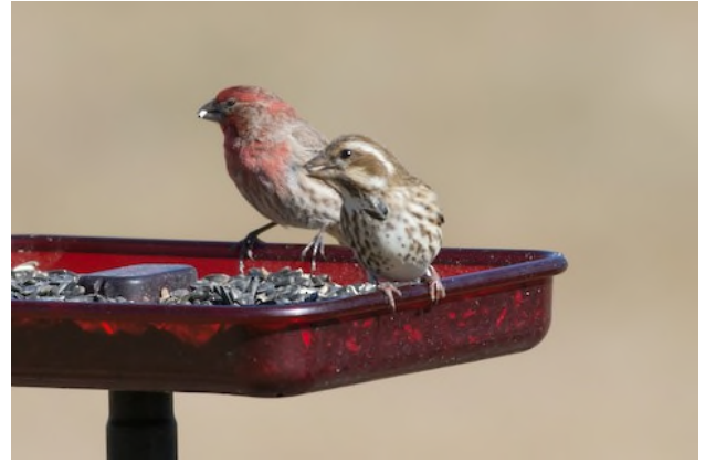
Purple Finch Haemorhous purpureus , Ashford way, March 3 2021 (Bill VanderMolen)

The Vreeland Rd corridor was the (only) place to go for Lapland Longspurs during March and April. Even then, picking them out among the Horned Larks and the corn stubble was quite the challenge! Some lucky observers got to see some decent-sized flocks, with 45 reported by birders visiting the nearby Upland Sandpipers on 4/30. Finding Snow Buntings proved significantly more challenging – although they were present alongside their close relatives in the Vreeland-Gotfredson area for the first two weeks of March, they were gone after that. We'll have to wait until late fall or these denizens of the far North to grace our fields again.