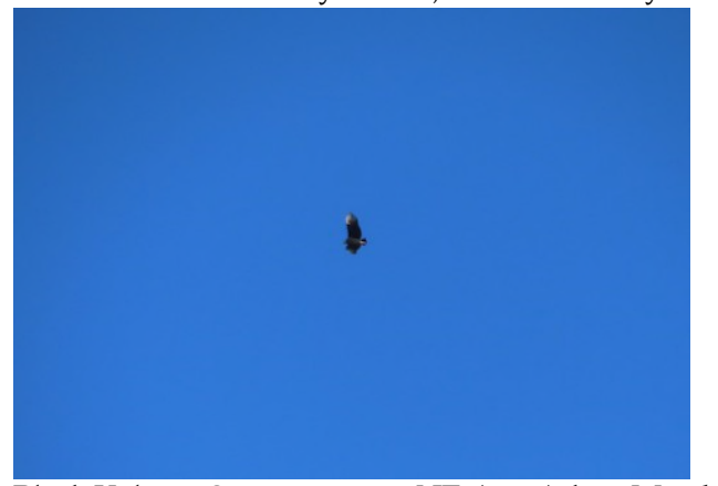
Black Vulture Coragyps atratus , NE Ann Arbor, March 7 2021

It seems Merlins have been on the increase in recent years, and wintering or migrating were observed in almost 15 locations, many of them clustered around the greater Ann Arbor area (likely an observer density effect). By the same token, migrating Peregrine Falcons also had a banner spring, with more than half a dozen reports away from the Central Campus nesting location. Most intriguingly, a probable Prairie Falcon was reported from the Watkins Lake County Preserve on 4/5, a bird with field marks consistent with that western rarity. If accepted, this would constitute a first county record, and one of very few records for Michigan.