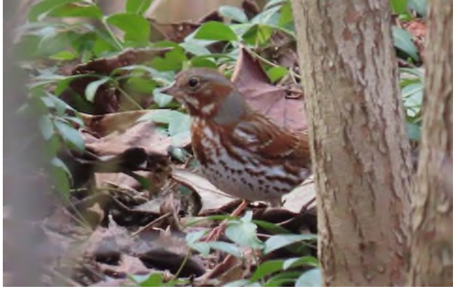
Fox Sparrow Passerella iliaca, Nichols Arboretum, March 23 2021