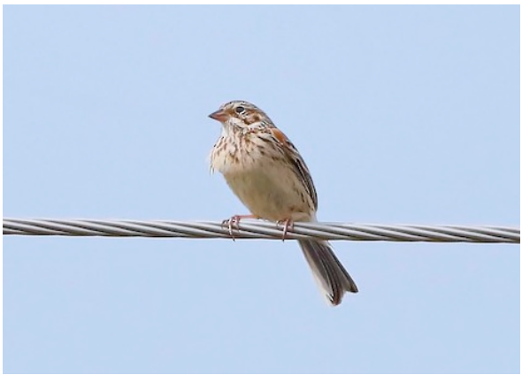
Vesper Sparrow Pooecetes gramineus , Vreeland Rd, April 18 2021 (Maggie Jewett)

Early spring is prime sparrow-watching time, and 2021 was no exception to that rule. An early Grasshopper Sparrow was present at Warren & Nixon on 4/26, and a Clay-colored Sparrow graced the Matthaei Botanical Gardens on 4/28. Fox Sparrows appear to have had a banner spring migration in Washtenaw County. Not only did