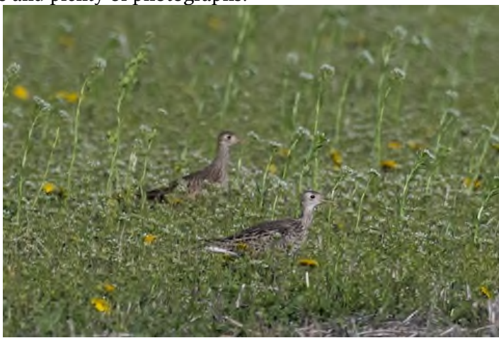
Upland Sandpiper Bartramia longicauda , Gotfredson Rd, April 30 2021 (Bill VanderMolen)

As winter (slowly) changes over to spring here in Washtenaw County, we eagerly await what exciting migrants might show up along with the nicer weather. For this year's early spring period, we had to wait until the very tail end, April 30, for the highlight to appear. This is not to say there we no other good birds to be had beforehand; far from it! But the pair of Upland Sandpipers that obligingly hung around for a few days in the field along Gotfredson, just south of Vreeland provided many local birders with their first real chance to see this very rare spring migrant. The most recent local record was also of a pair, in early June 2007, but those birds, and most other recent records, were one-day wonders, here one day, gone the next. By contrast, this pair not only stuck around for a few days, they were often within yards of the road, allowing for great views and plenty of photographs.