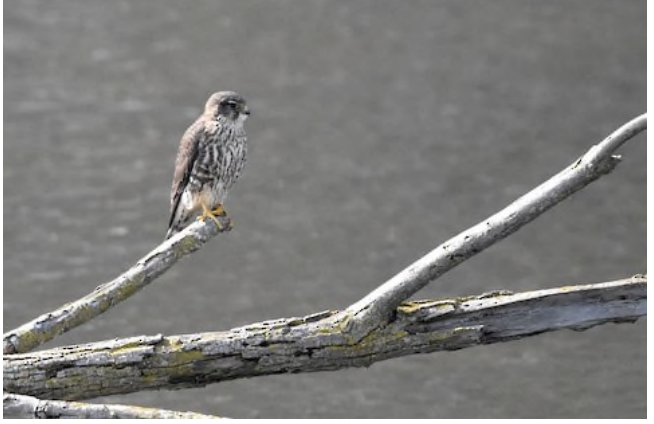
Merlin Falco columbarius, Superior Rd, March 8 2021