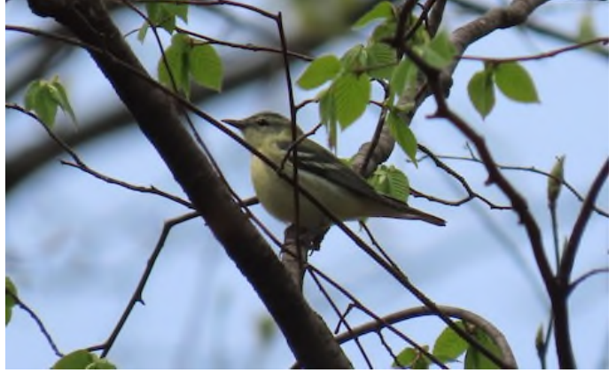
Cerulean Warbler Setophaga cerulea , West Scio Preserve, April 28 2021 (Karen Markey)