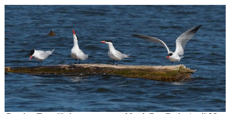
Caspian Tern Hydroprogne caspia , North Bay Park, April 25 2021 (Bill VanderMolen)

Not too surprisingly, the only tern species of the early spring period was Caspian Tern . That said, they were relatively well represented, being noted at half a dozen locations throughout the month of April. A maximum of four was at Ford Lake on 4/25. Now becoming an annual spring migrant, American White Pelicans are still an exciting find in Washtenaw County. Needless to say, quite a few people jumped on the chance to see the pair that was present for a few hours at Four Mile Lake on 4/28.