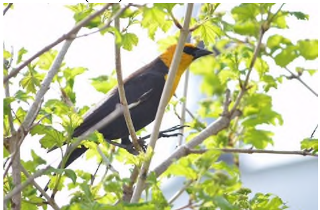
Yellow-headed Blackbird Xanthocephalus xanthocephalus , Jackson Rd, April 27 2021 (Susan Pulju)

Although a total of 17 warbler species were observed during the period, all but three of them appeared only during the last week of April! There was an apparently territorial Louisiana Waterthrush at Hudson Mills from 4/28 - 4/29, but none were reported from its traditional local nesting site at the Nan Weston Preserve. A female Prothonotary Warbler was very nicely photographed along the Huron River in Ypsilanti's Riverside Park on 4/29 but had moved on before other birders arrived. Four Orange-crowned Warblers were noted from scattered locations: at Nichols Arboretum (4/27 - 4/29), at Tubbs & Huron River Dr, at Redbud Park, and at LeFurge Woods – the latter three all date to 4/29. Quite unusually, a female Cerulean Warbler was photographed at the West Scio Preserve on 4/28 – it is not common for this rare local breeder to be seen away from its breeding ground in the Waterloo Recreation Area. Lastly, a few somewhat early Northern Parulas graced Dolph Park (4/28) and Vreeland Rd (4/29).