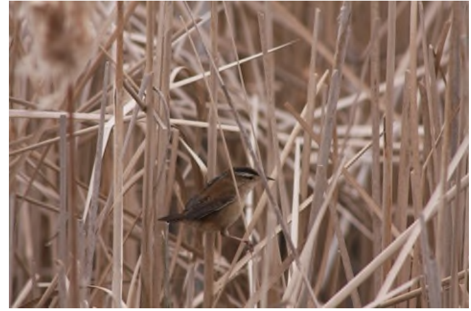
Marsh Wren Cistothorus palustris , North Bay Park, April 24 2021 (Geoffrey Tittyung)

Winter Wrens had quite a good spring – they were seen or heard in over 20 locations, several among them hosting two of these feisty little balls of fluff. Even if Four Mile Lake is a known spot for Sedge Wren , a bird found there on 4/28 was quite early by that species's standard. Two individuals of its close relative, the Marsh Wren , were noted there on the same day. Another Marsh Wren was photographed at North Bay Park on 4/24.