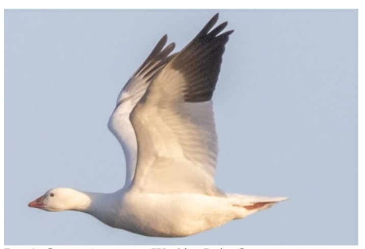
Ross's Goose Anser rossii , Watkins Lake County Preserve, March 21 2021 (Brendan Klick)