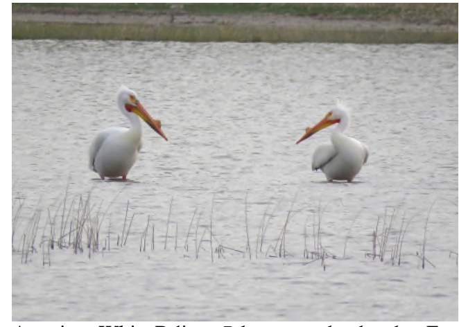
American White Pelican Pelecanus erythrorhynchos , Four Mile Lake, April 28 2021 (Linda Ar)

Another/the same Black Vulture from the previous period(s) was seen circling high over Ann Arbor's northeast side on 3/7. This record adds yet another data point to an impressive stay of this still very unusual species for Michigan. Just about as rare locally, a Golden Eagle over Sharon Valley Rd on 3/17 represents one of few recent spring records for that impressive raptor species. Somewhat unusually, no Rough-legged Hawks hung around their almost regular haunts along Vreeland Rd, and one bird at Four Mile Lake on 3/8 was the only record for this spring.