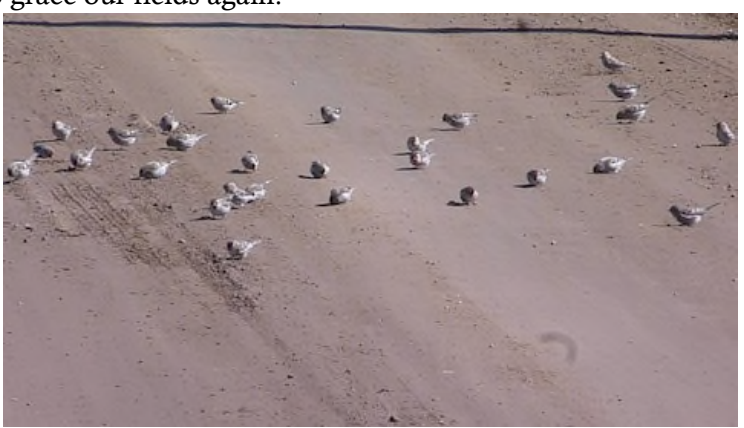
Common Redpoll Acanthis flammea , Steinbach & Luckhardt, March 6 2021