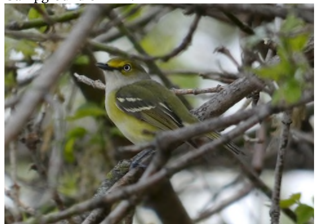
White-eyed vireo Virea griseus , Zeeb & Joy, April 27 2021 (Debi Bailey)

A generally southern species seemingly on the increase in Michigan, a White-eyed Vireo was seen and heard in a yard along Zeeb Rd on 4/27. Seven Blue-headed Vireos at Nichols Arboretum on 4/27 likely established an all-time high count for Washtenaw County. Continuing their relatively "abundant" status from the winter months, up to four Northern Shrikes hung around well into March. Single birds were observed at Independence Lake (3/1 - 3/4), at the West Lake Preserve (3/14), along Vreeland Rd (3/14 - 3/20), and at the Clark & Avis Spike Preserve (3/16). Although no longer quite as ubiquitous or numerous as they were during the peak of their irruption last fall, many, many Red- breasted Nuthatches remained in Washtenaw County through the end of April. Reports came in from close to 100 (!) different locations, and a still quite impressive maximum of eight was observed at the Cedar Lake Campground on 4/2.