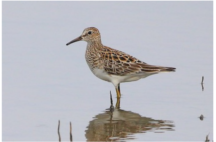
Pectoral Sandpiper Calidris melanotos , Vreeland Rd fluddle, July 24 2021 (Victor Chen)

Southbound Short-billed Dowitcher reports were limited to a group of five at Morgan & Platt (8/10) and a single bird along Vreeland on 8/25. Not often noted outside of spring, American Woodcocks at Ford & Prospect (7/27) and in Nichols Arboretum (8/31) were rather unusual. A Wilson's Snipe found at the Ann Arbor Airport on 7/14 presented a bit of a head-scratcher as far as its timing was concerned: late migrant or early migrant? One other snipe was at the Vreeland Rd fluddle from 8/22 - 8/27.