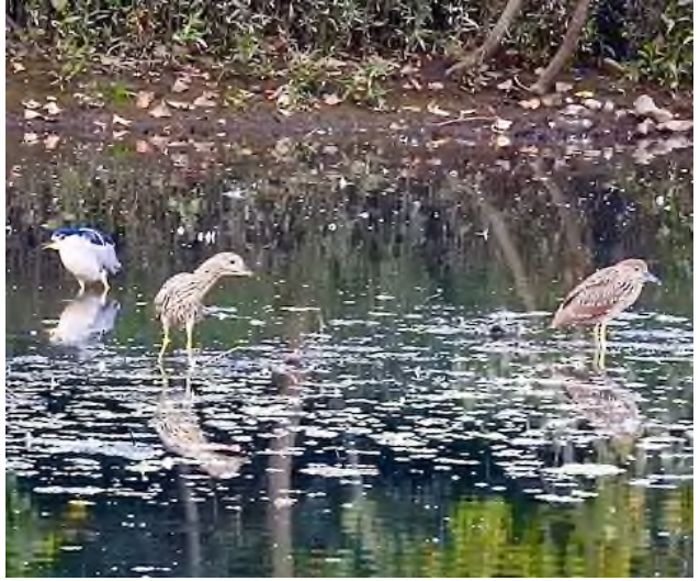
Black-crowned Night-Heron Nycticorax nycticorax, Mary Beth Doyle Park, August 18 2021