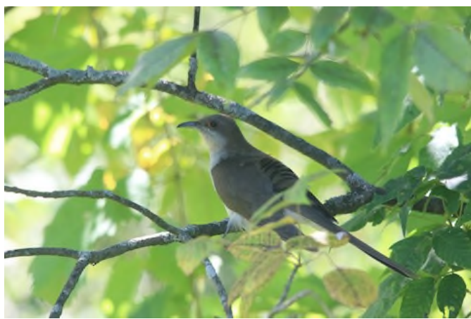
Black-billed Cuckoo Coccyzus erythropthalmus , Sharon Mills County Park, August 14 2021 (Dan Fox)