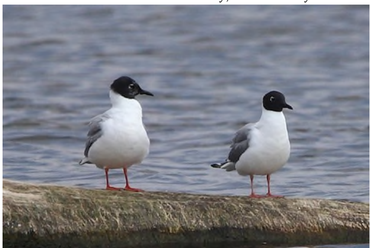
Bonaparte's Gull Chroicocephalus philadelphia , North Bay Park, August 7 2021 (Victor Chen)

A very early Bonaparte's Gull was flying over Four Mile Lake on 7/23; even if not unprecedented, this is one of a select few July observations for this species in Washtenaw County. A couple of weeks later, a small group of six birds was over Ford Lake (8/4 – 8/7) and another "Bonie" was over Four Mile Lake 8/17 – 8/20. Although they are not a local rarity per se, a whopping 31 Herring Gulls at North Bay Park on 8/8 is definitely a sizeable gathering for the summer months. Joining these birds was an equally impressive congregation of Caspian Terns : starting with a group of seven birds on 7/27, numbers built up to 27 birds on 8/19, before slowly decreasing again. Away from Ford Lake, only single birds were noted, at Wildwood Lake (8/11), Whitmore Lake (8/12), and South Pond (8/25). Sightings of any of the smaller tern species are always of note locally, but this August only single Forster's Terns were observed at North Bay Park (8/7) and Whitmore Lake (8/13) – neither of these birds stuck around for more than a day, unfortunately.