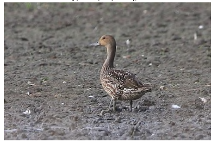
Northern Pintail Anas acuta , Vreeland Rd, August 10 2021 (Victor Chen)

The male Common Merganser hanging around several city parks along the Huron River in downtown Ann Arbor for the summer months (like in 2020) put on an interesting show case for that species's molt cycle by transitioning from the typical male into a female-type eclipse plumage.