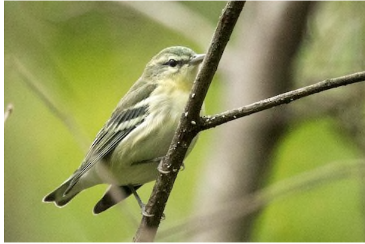
Cerulean Warbler Setophaga cerulea, Park Lyndon County Park, August 17 2021

One of the people looking for the Saline spoonbill turned up a Northern Parula in Wilderness Park on 7/17, quite an unusual date for that species. More in the realm of normalcy were two birds at Nichols Arboretum from 8/27 and one at Matthaei Botanical Gardens. Possibly nearby nesters or failed breeders, there were four records for Chestnut-sided Warblers , all in July: near Lyndon Twp Hall (7/10 – 7/18), along Embury Rd (7/18), and at the Bemis Rd marsh (7/21). Blackpoll Warblers started trickling in on 8/25 with two at Mary Beth Doyle Park, and two more at Nichols Arboretum on 8/28 – 8/29. Pine Warblers nest in scattered evergreen stands around the county, but none were noted after 7/25 when the males stopped singing. Quite early for this usually late migrant, a Yellow-rumped Warbler was at North Bay Park on 8/19; a few more seen at Loch Highland (8/26) and along Vreeland Rd (8/31). A Black-throated Green Warbler at Stinchfield Woods on 7/20 may have involved a bird trying to nest there, as this species has done in the past.