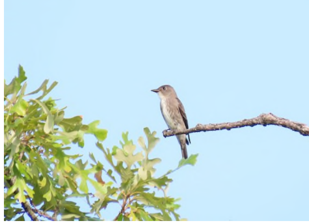
Olive-sided Flycatcher Contopus cooperi, Matthaei Botanical Gardens, August 18 2021

Likely nesting there, a White-eyed Vireo was present near Lyndon Township Hall from 7/14 - 8/6. Oddball Blue-headed Vireo reports came in from Marshall Park (7/6 - 7/7) and Bird Hills Park (7/21); more in line with the norm was one at Nichols Arboretum on 8/27. The only Philadelphia Vireo of the period was at Nichols Arboretum starting 8/29.