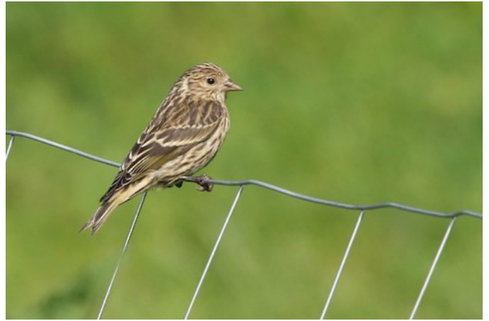
Pine Siskin Spinus pinus , Eberwhite Woods, July 12 2021, (Benjamin Hack)

Northern Mockingbirds continued at many of the places they were found during the spring period and were observed at a few scattered locales elsewhere. A completely unexpected summertime find was a Pine Siskin at Eberwhite Woods on 7/21 - there is only one other July record for this finch, from July 10, 2012. Grasshopper Sparrows largely went quiet after June. There was one singing bird along Meyers Rd on 7/12 and up to 3 birds at the Sharonville SGA throughout July. The same was true for Clay-colored Sparrows : only one male was heard at Rolling Hills County Park, on 7/25. By contrast, Vesper Sparrows were observed in many of the places they were found during the spring period, with a fledgling photographed at the Conservancy Farm on 7/30. A handful of good-sized Henslow's Sparrow colonies existed in the county this year: up to five birds at the Conservancy Farm (7/1 - 7/29), a whopping 8 birds at the Sharonville SGA (7/5 - 8/3), and three more at the Ann Arbor Landfill's hayfields (8/4 - 8/18). In addition, there were one or two singing males at four or five other spots. Only three Orchard Orioles were noted: in Dexter (8/6), at the Matthaei Botanical Gardens (8/6), and at Furstenberg Park (8/17).