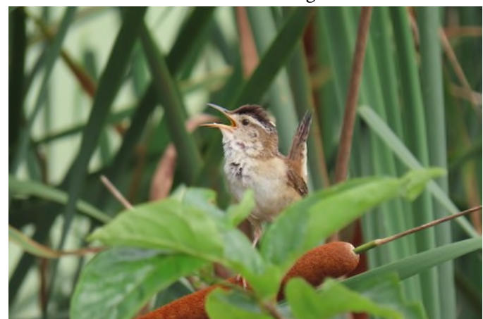
Marsh Wren Cistothorus palustris, Scio Church & Parker, July 17 2021