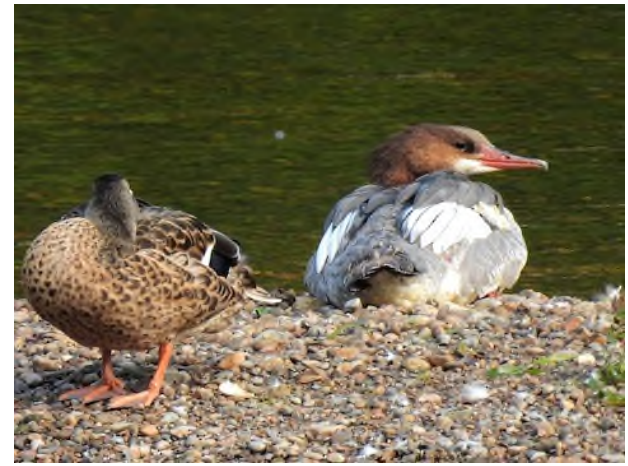
Common Merganser Mergus serrator, Nichols Arboretum, August 30 2021