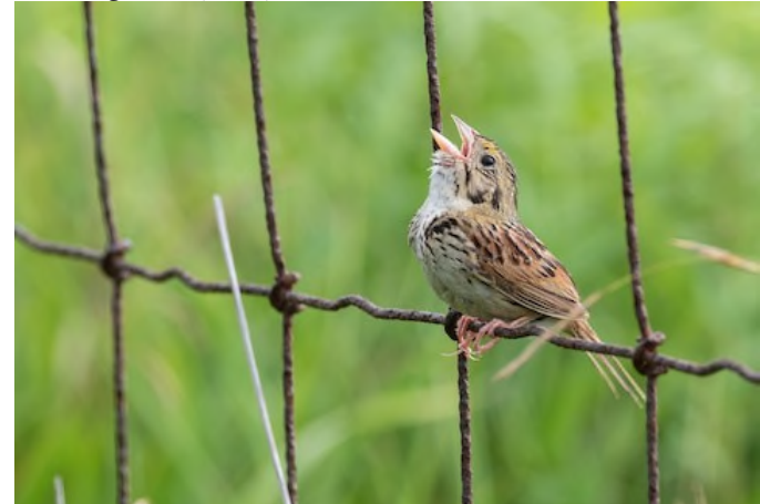
Henslow's Sparrow Centronyx henslowii , Sharonville SGA, July 17 2021 (Forest Jarvis)