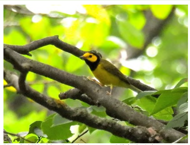
Hooded Warbler Setophaga citrina , Nichols Arboretum, August 27 2021 (Bill Nolting)