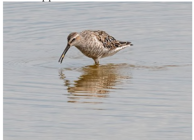
Stilt Sandpiper Calidris himantopus, Vreeland Rd fluddle, July 31 2021