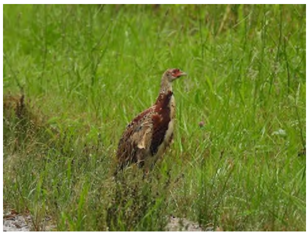
Ring-necked Pheasant Phasianus colchicus , Dixboro & Pontiac Trl, July 11 2021 (Bonnie Penet)