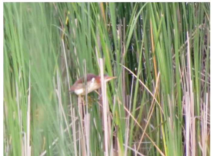
Least Bittern Ixobrychus exilis , LeFurge Woods, July 5 2021

Generally, Double-crested Cormorant is not a species 'worthy' of mention in this article, but some 120 birds roosting on the islands and driftwood at North Bay Park on 8/20 was an unusually large group away from Lake Erie. A few scattered July reports of Least Bitterns came in from Trinkle Marsh (7/4) and the Saline Fisheries Research Station (7/5); other than that, the territorial birds at LeFurge Woods were present throughout July and August. Indicating a good amount of post-breeding dispersal, Black-crowned Night-Herons were found in half a dozen locations, mostly of single birds hanging around for a few days. Exceptions were two birds at North Bay Park (8/7 – 8/24) and multiple birds of multiple ages at Mary Beth Doyle Park (8/6 – 8/30); on 8/18, a whopping 5 different birds were photographed there, an all-time high tally for the species in Washtenaw County. The Yellow-crowned Night-Heron at a complex of ponds at Tuttle Hill & Merritt was last seen on 7/8.