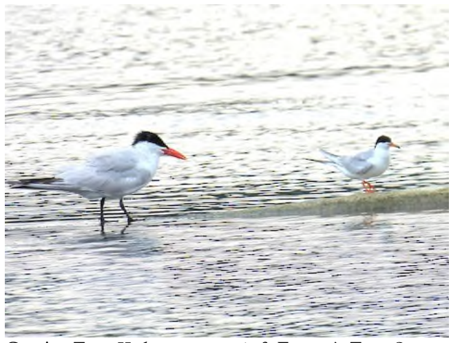
Caspian Tern Hydroprogne caspia & Forster's Tern Sterna forsteri , North Bay Park, August 7 2021 (Bill Nolting)