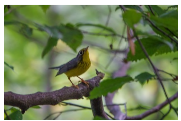
Canada Warbler Cardellina canadensis , Nichols Arboretum, August 29 2021 (Russell Ryan)

Two handsome Canada Warblers graced the Matthaei Botanical Gardens (8/25 - 8/30); another duo was in Nichols Arboretum (8/26 - 8/29). Two of their congener, the Wilson's Warbler , were at that hotspot as well (8/26 - 8/31); another one was in Whitmore Lake on 8/28. Dickcissels extended their excellent spring showing into an equally solid breeding season. Up to ten birds (on 7/9) were seen during July at the Sharonville SGA, and small colonies of 3-4 birds were at four other locations. Unfortunately, this local increase in breeding birds is likely related to the drought conditions in their core range, so what is good for us Washtenaw birders may not be such good news for these birds.