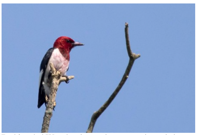
Red-headed Woodpecker Melanerpes erythrocephalus , Peregrine Falcon Fal Sharon Mills County Park, July 22 2021 (Michael Bowen) 2021 (Russell Ryan)

Interestingly, Barred Owls were by and large only reported from their usual haunts in the northwestern corner of the county; given the widespread spring observations, this is likely a reflection more of reduced observer efforts than of a lack of these handsome owls. Throughout July and August, family groups of Red-headed Woodpeckers were noted at scattered locations, involving up to four birds. A Merlin was at Silver Lake on 8/29, probably an early migrant. The Peregrine Falcon pair (and their off-spring) were clearly wandering around – one or two of these handsome falcons were seen around town, but also farther afield at Ford Lake and along Vreeland Rd.