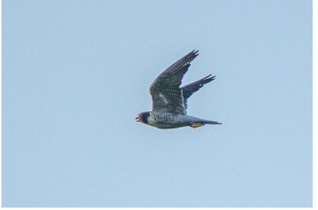
Peregrine Falcon Falco peregrinus , Vreeland Rd, July 31 2021 (Russell Ryan)