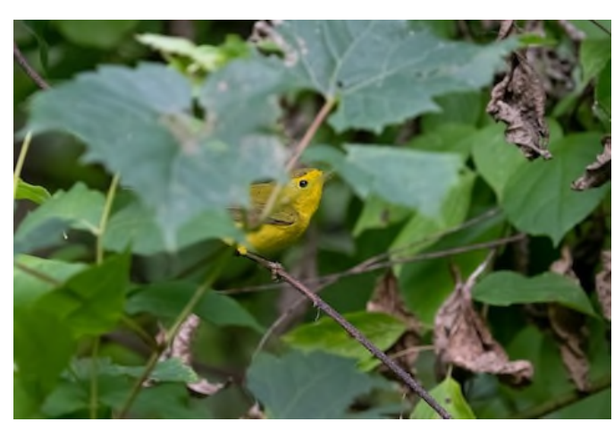
Wilson's Warbler Cardellina pusilla, Nichols Arboretum, August 31 2021