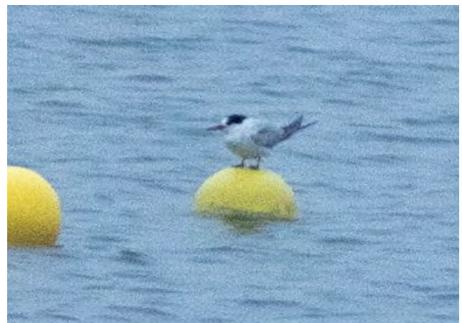
Common Tern Sterna hirundo , Whitmore Lake, September 23 2021 (Ben Winger)

Two Bonaparte's Gulls were over Four Mile Lake on 9/23; four more were at North Bay Park on 10/9 and a straggler was seen there on 10/28. An adult Lesser Black-backed Gull was seen flying over Nichols Arboretum by a WAS field trip