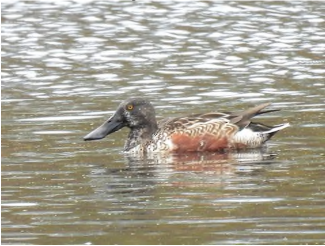
Northern Shoveler Spatula clypeata , Hewen's Creek Park, October 31 2021 (Bill Nolting)

There was a single early-ish Redhead at Independence Lake on 10/1; an additional quartet was mixed in with the geese at Ford Lake in Milan on 10/30. A completely odd-ball Greater Scaup was photographed on the pond at Olson Park on 9/26 and made for an interesting identification puzzle. The long-staying male Common Merganser along the Huron River in Ann Arbor continued through 10/21.