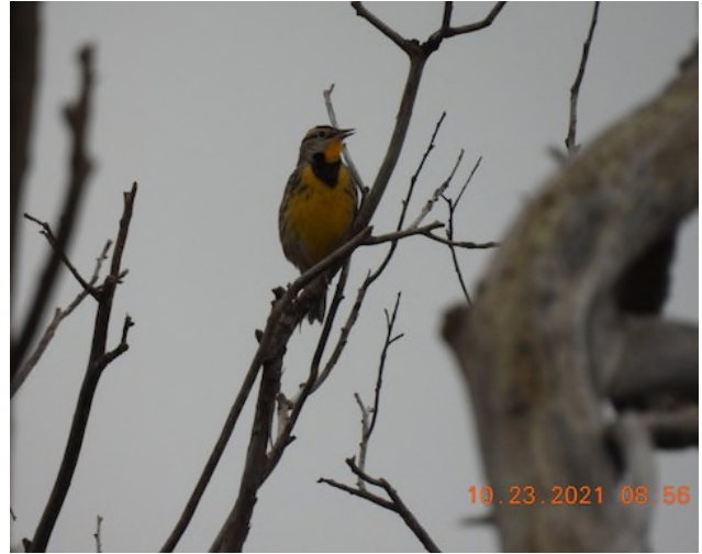
Eastern Meadowlark Sturnella magna , North Bay Park, October 23 2021 (Bruce Moorman)

Although all of us can think of major birding hotspots in Washtenaw County, there are only a handful that can boast a site list of 200 or more species. It won't surprise any of you that Four Mile Lake (226) and the Arb (216) top that list, but the number three site, Crooked Lake (201), is a bit more unexpected, and courtesy of the Hack brothers' efforts. During this past September-October period, two more sites joined this very select group. On September 16, a Philadelphia Vireo was the 200 th species for Independence Lake County Park and, on October 23, an Eastern Meadowlark was number 200 for Ford Lake's North Bay Park. Several other hotspots are close to the mark, so keep birding and make it happen, folks