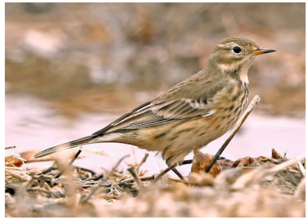
American Pipit Anthus rubescens , Willow Rd, October 6 2021 (Maggie Jewett)

Starting on 10/18, migrant Fox Sparrows were found at nearly a dozen locations, with a whopping eight of them at Independence Lake on 10/27. It appears Vesper Sparrows had by and large vacated Washtenaw County by the end of August; the only exceptions were a bird at Nichols Arboretum on 9/12 and one at Torrey Rd on 10/10. Although by no means uncommon during fall, a group of 30 Savannah Sparrows along Whitmore Lake Rd must have come quite to setting a high tally for that species. Not quite as large of a flock, but impressive nonetheless, ten Lincoln's Sparrows at the Jack Smiley Preserve on 9/30 must be close to a record as well. A handful of hardy Baltimore Orioles stayed well into September but had departed before the start of October. As a severely declining species, it was good to see Rusty Blackbird reports coming in from almost 15 locations. The highest concentration (of 14 birds) was in the wetlands of Independence Lake on 10/31. In addition to providing species number 200 for North Bay Park, a total of 35 Eastern Meadowlarks at Torrey Rd on 10/10 established yet another high count this fall.