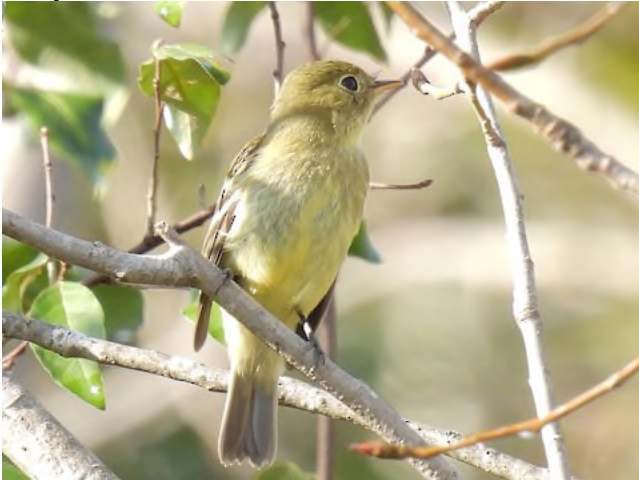
Yellow-bellied Flycatcher Empidonax flaviventris , North Hydro Park, October 9 2021 (Bill Nolting)

Away from the Arb, Olive-sided Flycatchers put in appearances at half a dozen spots; only the Arb hosted more than one bird, where two were noted on a number of occasions. Often hard to come by, Yellow-bellied Flycatchers were at nearly ten locations this fall, with the last of the main push on 9/17. However, a straggler was found at North Hydro Park at the (very) late date of 10/9 – perhaps another consequence of the warm fall? Fall 2021 (through 10/3) proved to be very good for Philadelphia Vireos ; not only were they at more than twenty locations, but in quite a few of them more than one bird was present, with as many as three at Nichols Arboretum on 9/12.