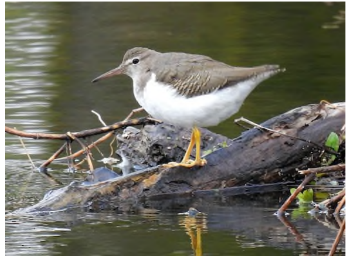
Spotted Sandpiper Actitis macularius , North Bay Park, October 30 2021 (Bill Nolting)