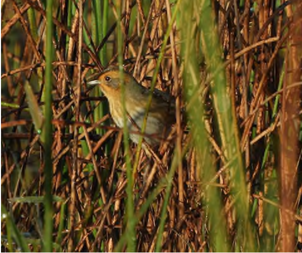
Nelson's Sparrow Ammodramus nelsoni , Vreeland & Prospect, October 1 2021

It's been five years since it was discovered that the (restricted access) Water Treatment Easement property at the intersection of Vreeland and Prospect hosted one or two migrating Nelson's Sparrows in late September – early October. Since then, largely due to restricted access to the site, there have been very few reports of this secretive species there, but this year a couple of these dapper sparrows were located there once again during a tour of that site. Certainly a treat for the observers!