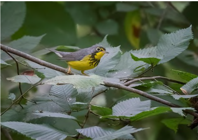
Canada Warbler Cardellina canadensis , Nichols Arboretum, September 12 2021 (Jocelyn Anderson)

Hard to find during spring migration (when they sing), Connecticut Warblers are even harder to find during fall (when they don't sing). It was, therefore, quite exciting that two different birds were found this fall: one was at the Matthaei Botanical Gardens (9/8) and, to the delight of many, another spent several days in Nichols Arboretum (9/9 – 9/13). Twice as many Mourning Warblers were observed, all of them one-day wonders: at Loch Highland (9/1), at the M-14 pond (9/8), at Nichols Arboretum (9/14), and on private property in Lodi Township (9/18). A few Hooded Warblers dallied in our area, but only one of them, a bird at the Arb from 9/6 - 9/12, hung around for more than a day. A long-staying Canada Warbler at that same hotspot enthralled many birders from 9/3 – 9/28. The other three observed this fall were all, more typically, one-day wonders: at the Leonard Preserve (9/5), the Bot Gardens (9/8), and at the Miller Nature Area (9/18). By contrast, Wilson's Warblers were almost common this fall – not only were they reported from nearly 20 locations, there were as many as four of them in the Arb (9/11)!