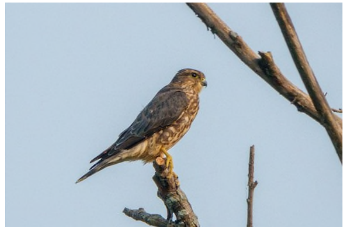
Merlin Falco columbarius , North Bay Park, September 11 2021 (Russell Ryan)