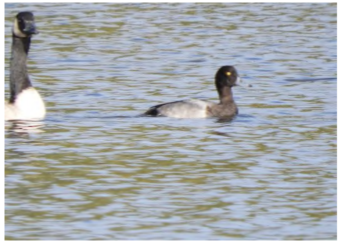
Greater Scaup Aythya marila , Olson Park, September 26 2021 (Yvonne Burch-Hartley)

After a good showing during the summer, Ring-necked Pheasants virtually vanished, with only three reports, all of single birds, this fall. An exceedingly early Horned Grebe was reported from the pond at Scio Church & Parker on 9/8; a more seasonably appropriate bird was on Independence Lake on 10/7. Yellow-billed Cuckoos moved through in impressive numbers this fall, with a whopping five individuals were in the Arb on 9/18. The final report for this species came in on 10/3. By contrast, only three Black-billed Cuckoos were sighted during September: at Nichols Arboretum (9/2 – 9/13), in Whitmore Lake (9/10), and at Independence Lake (9/17). Of course, there could have been more than one individual involved for the Arb reports, but with their more northerly nesting range, one might expect higher numbers for this species in the fall migration window.