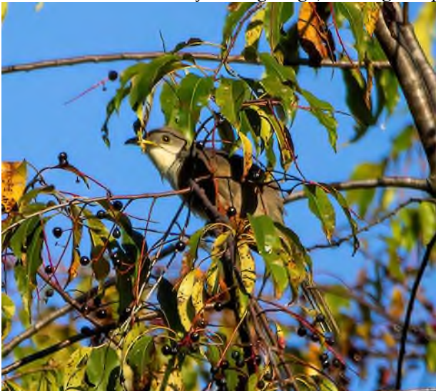
Yellow-billed Cuckoo Coccyzus americanus , Hudson Mills Metropark, September 6 2021 (Karen Kessler)

After a good showing during the summer, Ring-necked Pheasants virtually vanished, with only three reports, all of single birds, this fall. An exceedingly early Horned Grebe was reported from the pond at Scio Church & Parker on 9/8; a more seasonably appropriate bird was on Independence Lake on 10/7. Yellow-billed Cuckoos moved through in impressive numbers this fall, with a whopping five individuals were in the Arb on 9/18. The final report for this species came in on 10/3. By contrast, only three Black-billed Cuckoos were sighted during September: at Nichols Arboretum (9/2 – 9/13), in Whitmore Lake (9/10), and at Independence Lake (9/17). Of course, there could have been more than one individual involved for the Arb reports, but with their more northerly nesting range, one might expect higher numbers for this species in the fall migration window.