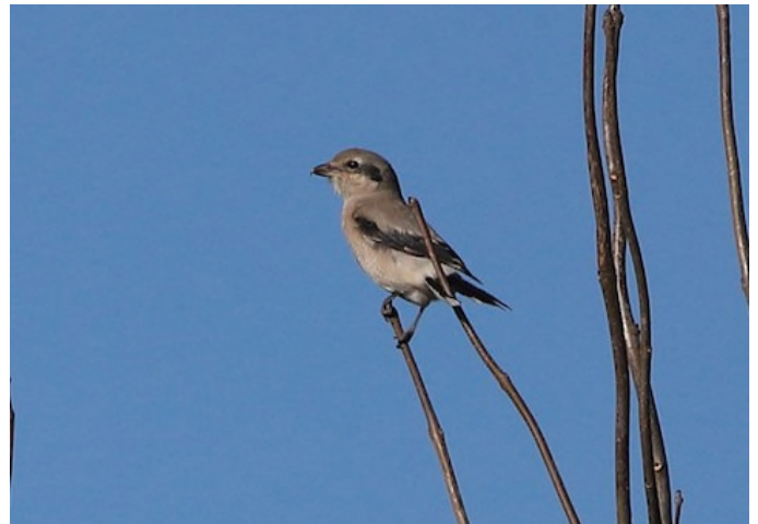
Northern Shrike Lanius borealis , Vreeland Rd, October 18 2021 (Victor Chen)

In line with their regular arrival time, Northern Shrikes showed up at County Farm Park and along Vreeland Rd on 10/18. A Blue-gray Gnatcatcher in Ann Arbor on 10/23 was exceedingly late; normally, the little sprites are all gone by mid-September! A possible Sedge Wren at Dolph Park on 9/10 would be the only remaining bird after a good nesting season in Washtenaw County. Marsh Wrens were a bit easier to come by, with up to two birds seen at seven sites well into October.