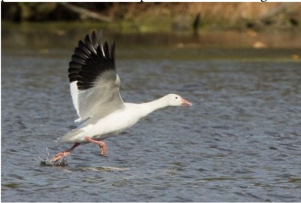
Snow Goose Anser caerulescens , Pierce Lake, October 28 2021 (Michael Bowen)

Each fall, migrant geese start showing up at the end of October and, like clockwork, that pattern repeated itself this year. First, a lone Snow Goose was found on Pierce Lake on 10/28 and later that day a family group of three Snow Geese was mixed in with the loafing Canada Geese at Ford Lake in Milan. In that same large flock of geese, as many as six Cackling Geese were picked out as well. Both species remained through the end of October.