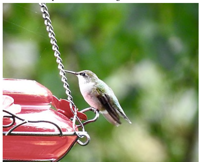
Ruby-throated Hummingbird Archilochus colubris , Ann Arbor, October 14 2021 (Nui Moreland)