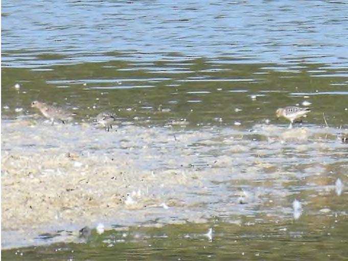
Baird's Sandpiper Calidris bairdii , M-14 Pond, September 10 2021 (Bill Nolting)

Southbound migration of Semipalmated Plovers continued through mid-September with up to six birds at Four Mile Lake (9/7 – 9/23) and two more at the M-14 pond on Ann Arbor's north side (9/8 – 9/10). A one-day wonder Upland Sandpiper was observed near the fluddle on the western end of Vreeland Rd on 9/5. As many as three Baird's Sandpipers stopped over at the M-14 pond from 9/8 – 9/10; a singleton of the species was at Four Mile Lake on 9/23. Even though they are not an uncommon fall migrant in Washtenaw County, a concentration of 45 Wilson's Snipes along Vreeland Rd on 10/29 made for a record high count locally. Most often seen/heard during their display season in early spring, American Woodcocks were found in an impressive five locations this fall, almost all of them birds flushed from trail edges by hiking birders. A Spotted Sandpiper remained at North Bay Park through 10/30 and, in doing so, set a new late date for that species in our area.