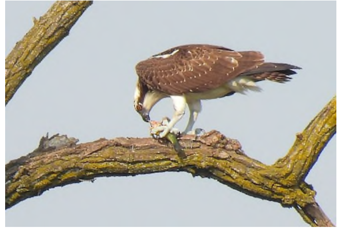
Osprey Pandion haliaetus , Hewen's Creek Park, October 1 2021 (Bill Nolting)

Ospreys had a banner fall locally, with quite a few reports from numerous sites, all involving one or two birds – the final report for this migratory species was on 10/17. Golden Eagles are never easy to find in our county, so a bird over Whitmore Lake Rd (near Joy) on 10/23 was a nice surprise. More expected (if the right wind direction materializes) was a bird soaring over the Torrey Rd hawk watch on 10/30, delighting the observers there. Often confined to a very narrow fall migration window, Broad-winged Hawks came through in quite massive numbers on 9/17 (a record high 900 over the Matthaei Botanical Gardens) and 9/18 (400 over Ann Arbor's east side). A lone bird over northwestern Ann Arbor on 10/10 appears to have been the last of the fall. An impressive southbound movement of Red-tailed Hawks was noted over Torrey Rd on 10/28, setting a new record high of 35 birds. The first Rough-legged Hawk appeared right on time at Vreeland & Gotfredson on 10/26.