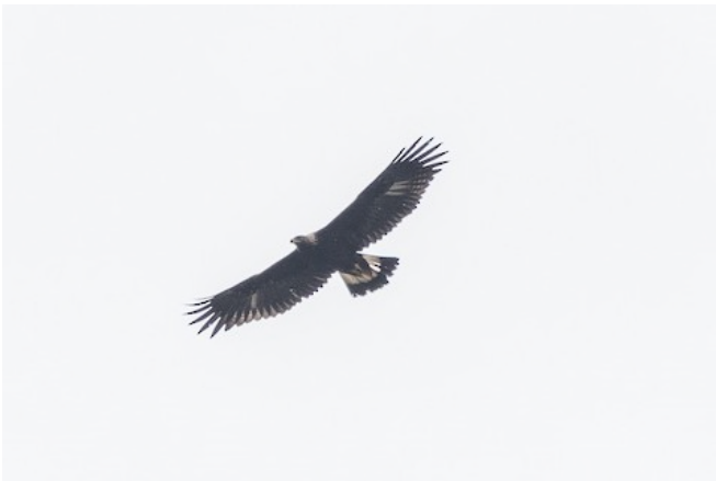
Golden Eagle Aquila chrysaetos , Torrey Rd, October 30 2021

Ospreys had a banner fall locally, with quite a few reports from numerous sites, all involving one or two birds – the final report for this migratory species was on 10/17. Golden Eagles are never easy to find in our county, so a bird over Whitmore Lake Rd (near Joy) on 10/23 was a nice surprise. More expected (if the right wind direction materializes) was a bird soaring over the Torrey Rd hawk watch on 10/30, delighting the observers there. Often confined to a very narrow fall migration window, Broad-winged Hawks came through in quite massive numbers on 9/17 (a record high 900 over the Matthaei Botanical Gardens) and 9/18 (400 over Ann Arbor's east side). A lone bird over northwestern Ann Arbor on 10/10 appears to have been the last of the fall. An impressive southbound movement of Red-tailed Hawks was noted over Torrey Rd on 10/28, setting a new record high of 35 birds. The first Rough-legged Hawk appeared right on time at Vreeland & Gotfredson on 10/26.