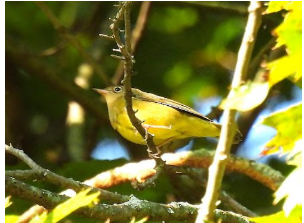
Connecticut Warbler Oporornis agilis , Nichols Arboretum, September 9 2021 (Bill Nolting)

Hard to find during spring migration (when they sing), Connecticut Warblers are even harder to find during fall (when they don't sing). It was, therefore, quite exciting that two different birds were found this fall: one was at the Matthaei Botanical Gardens (9/8) and, to the delight of many, another spent several days in Nichols Arboretum (9/9 – 9/13). Twice as many Mourning Warblers were observed, all of them one-day wonders: at Loch Highland (9/1), at the M-14 pond (9/8), at Nichols Arboretum (9/14), and on private property in Lodi Township (9/18). A few Hooded Warblers dallied in our area, but only one of them, a bird at the Arb from 9/6 - 9/12, hung around for more than a day. A long-staying Canada Warbler at that same hotspot enthralled many birders from 9/3 – 9/28. The other three observed this fall were all, more typically, one-day wonders: at the Leonard Preserve (9/5), the Bot Gardens (9/8), and at the Miller Nature Area (9/18). By contrast, Wilson's Warblers were almost common this fall – not only were they reported from nearly 20 locations, there were as many as four of them in the Arb (9/11)!