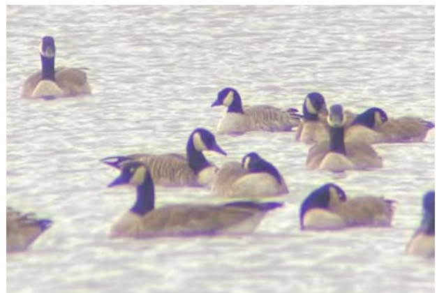
Cackling Goose Branta hutchinsii , Ford Lake - Milan, October 28 2021 (Roberto San Antonio)