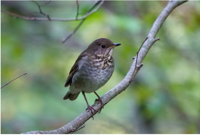
Gray-cheeked Thrush Catharus minimus , Nichols Arboretum, September 24 2021 (Russell Ryan)