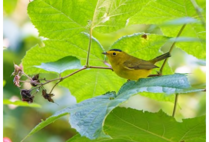
Wilson's Warbler Cardellina pusilla , Nichols Arboretum, September 11 2021 (Russell Ryan)