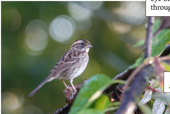
White-throated Sparrow at Nichols Arboretum, September 2021

With this effort, we made good progress in opening up the area along the headwaters of Stony Creek, but more work is ahead of us to further improve the habitat for native plants. So keep an eye on the WAS website for additional work dates throughout 2022 and join us!