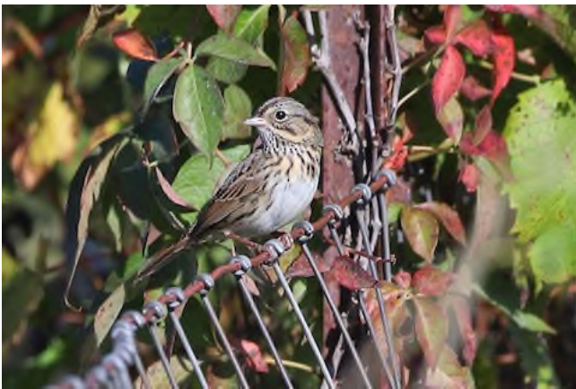
Lincoln's Sparrow Melospiza lincolnii , Conservancy Farm, October 1 2021 (Victor Chen)

Starting on 10/18, migrant Fox Sparrows were found at nearly a dozen locations, with a whopping eight of them at Independence Lake on 10/27. It appears Vesper Sparrows had by and large vacated Washtenaw County by the end of August; the only exceptions were a bird at Nichols Arboretum on 9/12 and one at Torrey Rd on 10/10. Although by no means uncommon during fall, a group of 30 Savannah Sparrows along Whitmore Lake Rd must have come quite to setting a high tally for that species. Not quite as large of a flock, but impressive nonetheless, ten Lincoln's Sparrows at the Jack Smiley Preserve on 9/30 must be close to a record as well. A handful of hardy Baltimore Orioles stayed well into September but had departed before the start of October. As a severely declining species, it was good to see Rusty Blackbird reports coming in from almost 15 locations. The highest concentration (of 14 birds) was in the wetlands of Independence Lake on 10/31. In addition to providing species number 200 for North Bay Park, a total of 35 Eastern Meadowlarks at Torrey Rd on 10/10 established yet another high count this fall.