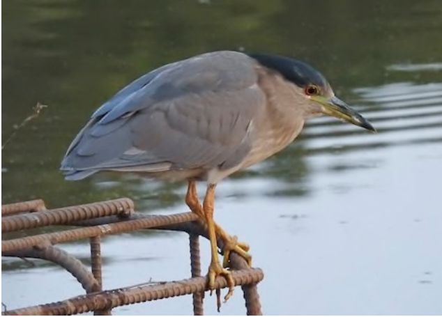
Black-crowned Night-Heron Nycticorax nycticorax , Mary Beth Doyle Park, October 1 2021 (Nui Moreland)

By and large, Common Loons start trickling into our area around the start of November, so a bird on Four Mile Lake on 9/23 is quite extraordinary. The large number Double-crested Cormorants noted in the previous rarity write-up continued to build into September, culminating into a record high tally of 200 (!) birds on 9/13. Clearly things are going well in the Lake Erie basin for this species! Black-crowned Night-Herons continued in three of the locations they were found over the summer, with single birds at North Bay Park (9/12 – 9/26) and North Hydro Park (9/25 – 10/13). Mary Beth Doyle Park remained the hotspot (through 10/6), which five birds there on 10/1 offering a nice study in the various plumages of this dapper little heron.