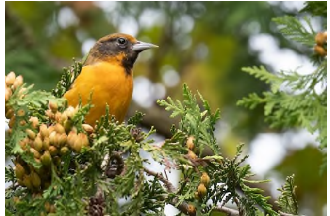
Baltimore Oriole Icterus galbula , Nichols Arboretum, September 20 2021 (Ben Lucking)