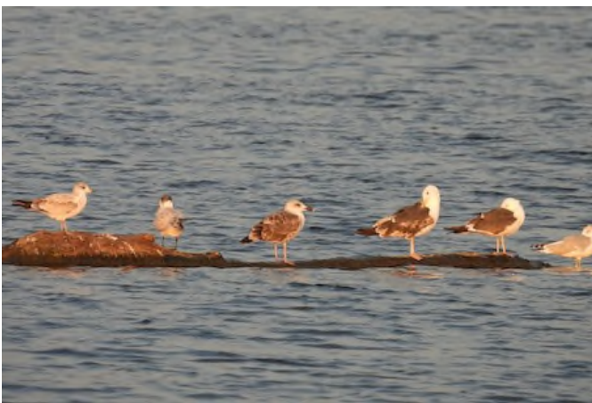
Lesser Black-backed Gull Larus fuscus , North Bay Park, September 19 2021 (Bonnie Penet)