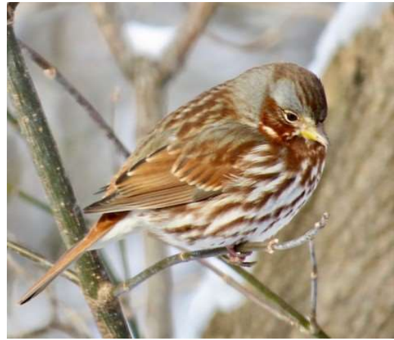
Fox Sparrow Passerella iliaca , Loch Highland, January 22 2022 (Cathy Theisen)

Often one of the earliest harbingers of spring, male Red-winged Blackbirds showed up remarkably early, with as eight of them at the Chelsea SGA on 1/12. Similarly, Brown-headed Cowbirds arrived locally in decent numbers during January as well – the largest group was one of 11 crowded onto a feeder near Dexter on 1/7. The first northbound Rusty Blackbird was noted at Waterworks Park on 2/21; additional Rusties were at McKinley and Island Lake Rd (4, on 2/25) and along Vreeland Rd (2, also on 2/25). Common Grackles remained into January at three sites, with two along Lodi Ln on 1/1 the maximum. After the parulid bonanza in the early winter period, only one species, the Yellow-rumped Warbler , remained into winter proper. Extending their good December showing, they were still being seen in six places during January, with an impressive three at Four Mile Lake on 1/23. Perhaps the cold snap during that month forced some of these birds south (or proved lethal), because numbers were much lower during February and likely involved the first northbound migrants, as evidenced by four at Waterworks Park on 2/21.