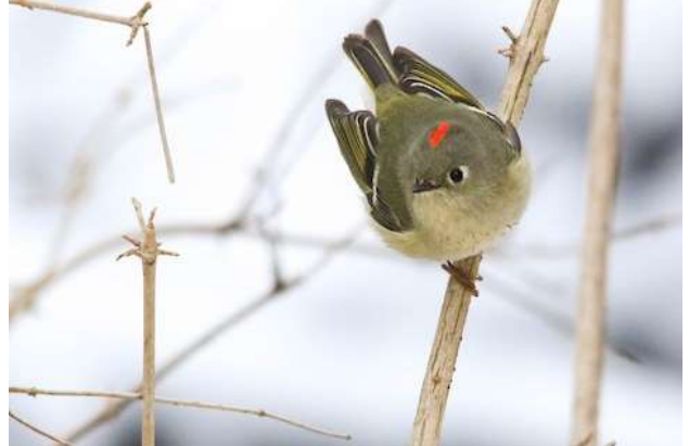
Ruby-crowned Kinglet Corthylio calendula , Foster Nature Area, January 5 2022 (Benjamin Hack)