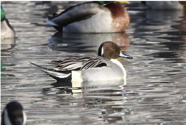
Northern Pintail Anas acuta, Mary Beth Doyle Park, February 5 2022

A few scattered Northern Shovelers were noted during January-February, with two at the Meyer Preserve (1/1), one in the Furstenberg-Gallup area (1/1 – 1/12), and one (the same?) at Gallup nearly a month later (2/5). Mallards are obviously not a regular in this article, but the impressive record high flock of 1,000 at North Hydro Park on 1/27 is certainly worth mentioning! There was a Northern Pintail on the Raisin River in Manchester on 1/12, and a lone male spent two weeks at Mary Beth Doyle Park (1/22 – 2/6). A pair of these handsome dabbling ducks made a temporary home at North Bay Park from 2/10 – 2/28, and these two birds were likely also reported from nearby North Hydro Park on 2/28. A group of four male Green-winged Teal appears to have roamed around the north side of Ann Arbor in early January; they were seen at Olson Park on 1/1, and then moved onto the Huron River near Wagner from 1/3 – 1/13. Three more of these dapper little ducks were on Little Lake on 2/13.