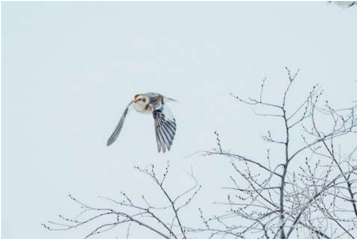
Snow Bunting Plectrophenax nivalis , Vreeland Rd, January 5 2022 (Jackie Rutherford)

above, several of these birds were attending feeders, but there was one at the Arb (1/2) that likely moved on the Arb-Gallup Bikepath, where it stayed from 1/9 – 1/18, and where it may have been relocated on 2/14.