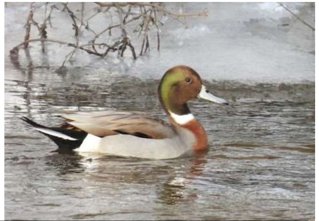
Northern Pintail x Mallard Anas acuta x platyrhynchos , Waterworks Park, February 20 2022 (Bruce Moorman)

The depths of winter are hard on birds and birders alike. That said, for those hardy birders that brave often inclement weather, there are plenty of avian gems out there. One such treasure, even if not a species per se, was found on 2/18 among the waterfowl gathered in one of few remaining stretches of open water in the Huron River at Waterworks Park in Ypsilanti. A male Northern Pintail x Mallard hybrid was present there (if hard to find) for nearly a week, before departing on 2/24. It was relocated on 2/28 at nearby North Hydro Park, as well as on a small pond in a subdivision on Willis Rd, near Whittaker Rd. Even though both parent species are widely distributed across the Holarctic area, this hybrid combination appears to be relatively rare, and the Waterworks bird made for only the fifth ever in Michigan.