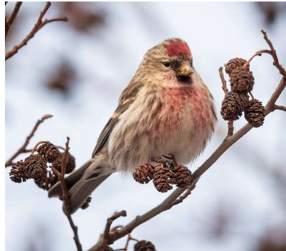
Common Redpoll Acanthis flammea , Gallup Park, January 22 2022

Purple Finch reports were limited to one or two birds coming to feeders at five rather widely spaced set-ups; that said, the bulk of them were in the northwestern quarter of the county. As mentioned in the Highlights section, Common Redpolls moved into our area in a big way, increasing in number steadily until as many as 80 were in a single flock, in addition to smaller numbers in 10+ locations here and there. By February, the flock that roamed the Furstenberg-Gallup area had boomed to a whopping 180 birds (a new County high count)! Although they were widely distributed, Pine Siskin numbers were nowhere near their close relative's above, with flock size topping out at 15 or so.