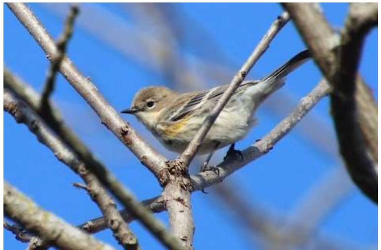
Yellow-rumped Warbler Setophaga coronata , Pierce Lake, January 19 2022 (Keith Roath)