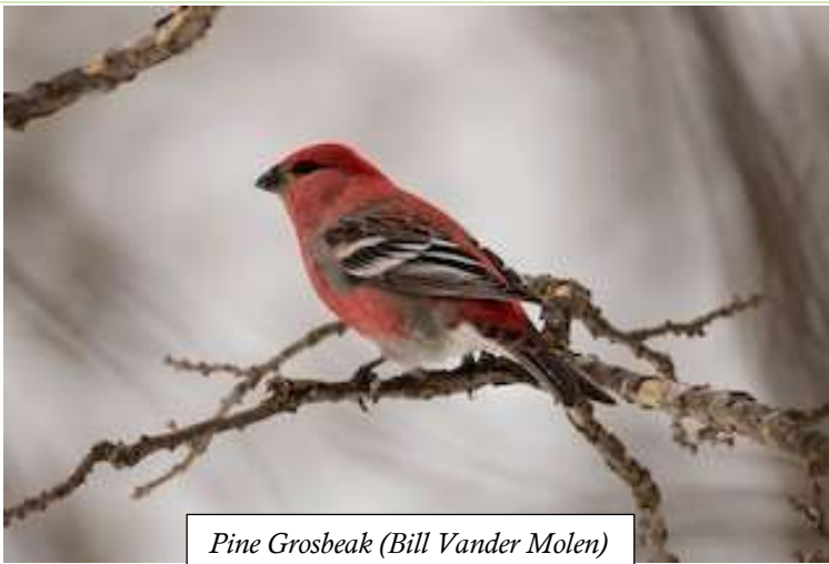
Pine Grosbeak

Thanks to all the folks who made the trip, the great spotters, the awesome photographers, and the camaraderie that made it seem almost like the befores. Here is our eBird Trip Report, where you can see all the great birds we encountered on our frozen fantastic foray to the UP. https://ebird.org/tripreport/38652 Click on individual bird species to see all the fabulous photos.