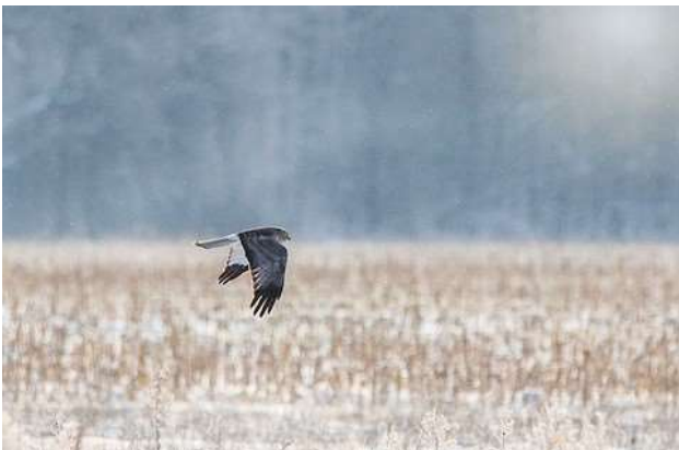
Northern Harrier Circus hudsonius , Vreeland Rd, February 5 2022

The occurrence of Turkey Vultures largely followed the pattern noted for Sandhill Cranes. During the first part of January, a few birds hung around here and there, but were pushed out by the mid-January cold. By the time February rolled around, numbers started building again and TUVUs were noted over dozens of locations. A sign of the species's continuing increase, there were a whopping 11 Bald Eagles around the Bridge Rd dam and North Hydro Park on 1/3, setting a new County high count. Throughout the period, about a dozen sites hosted up to three Northern Harriers . It appears to have been a very good winter season for Sharp-shinned Hawks , with dozens of locations hosting individual birds. The same held true for Red-shouldered Hawks : based on the spread of reports, there were likely some 15 individuals present in the County during January and February. Centered around