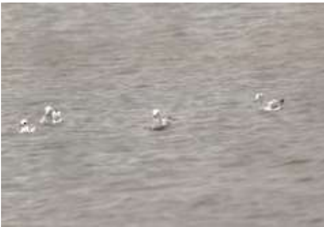
Bonaparte's Gull Chroicocephalus philadelphia , Portage Lake, January 1 2022 (Russell Ryan)

Not usually thought of as a winter gull species, a group of some 15 Bonaparte's Gulls on Portage Lake (1/1 & 1/2) was quite a surprise. Significantly more expected was the fact that the main hotspot for unusual, wintertime gulls was the landfill in Salem Township. Unfortunately, access to the site has been restricted and gull watching can now mostly be done from the side of Six Mile Rd only. Still, a good variety of larid treasure was found there during January. On 1/8, both an adult “ Thayer's ” Iceland Gull and an adult Glaucous Gull were photographed. Ten days later, on 1/18, both of the black-backed were present, with an adult Lesser Black-backed Gull and an adult Great Black-backed Gull . A first cycle individual of the latter species was seen flying past the Foster Nature Area of 1/5, making for one of very few county records away from the Salem Landfill or North Bay Park.