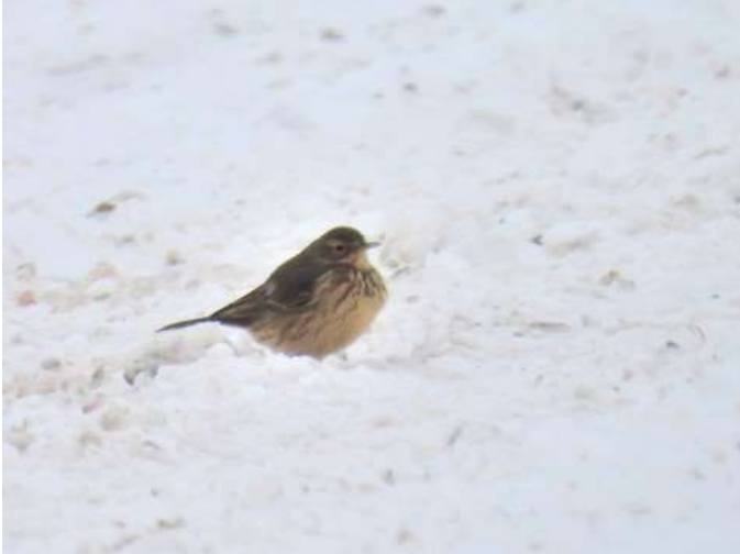
American Pipit Anthus rubescens , Vreeland Rd, January 24 2022 (Bill Nolting)

The three Winter Wrens present in January were joined by the first northbound birds in February, when individuals were turned up in seven locations. Birders looking for the redpolls at Furstenberg Park turned up a Gray Catbird , which spent 1/17 – 1/18 there. Interestingly, another (or the same?) catbird was found nearby along the Arb-Gallup Bikepath on 2/12. Bucking a recent trend, no reports of Northern Mockingbirds came in from the Manchester area; one was seen at Willow & Macon (1/21) and another was at Huron River Dr & Whittaker (2/28). Joining the flocks of other open-country passerines, an American Pipit spent two days along Vreeland Rd from 1/23 – 1/24 and made for only the second ever winter record locally.