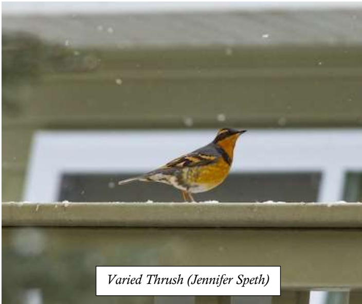
Varied Thrush