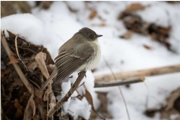
Eastern Phoebe Sayornis phoebe, Foster Nature Area, January 6 2022

To prove the point I made in the previous Rarity Article, the Foster Nature Area Eastern Phoebe stayed until the incredibly