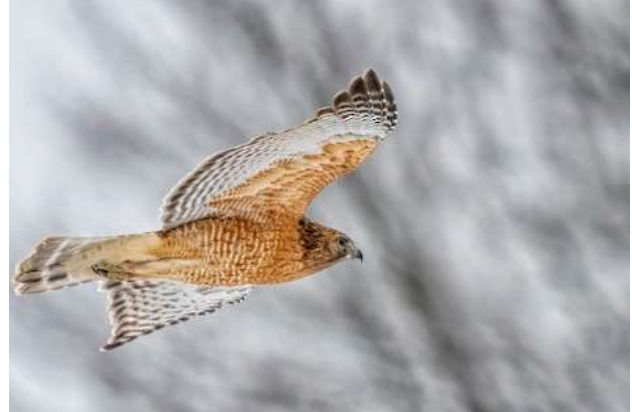
Red-shouldered Hawk Buteo lineatus, Whitmore Lake, February 11 2022