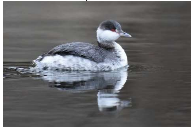
Horned Grebe Podiceps auritus , North Hydro Park, January 20 2022 (Geoffrey Clarke)