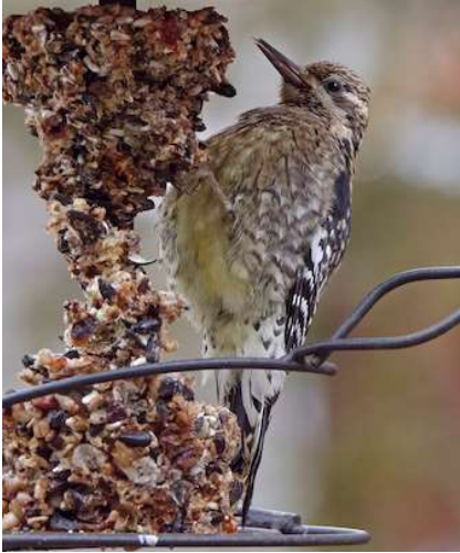
Yellow-bellied Sapsucker Sphyrapicus varius , Packard & Independence, January 17 2022 (Martha Hitchiner)

Quite notably were the Yellow-bellied Sapsuckers that stayed into January (one or two birds at some nine locations), and even February (singletons at three sites). The family group of five Red-headed Woodpeckers at Independence Lake settled in for the duration and was observed throughout the period. A few more of this handsome woodpecker were seen at a handful of scattered sites throughout the county.