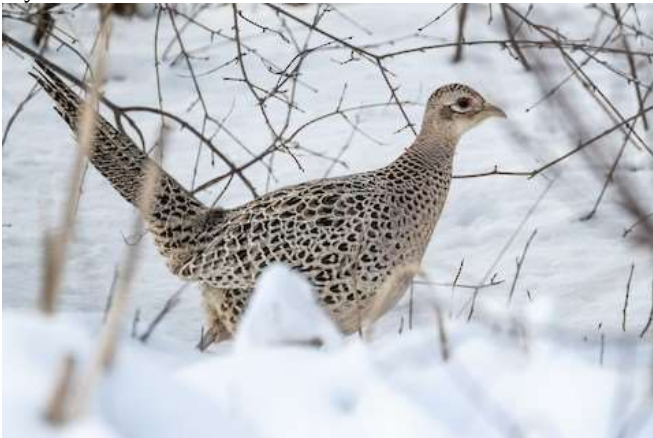
Ring-necked Pheasant Phasianus colchicus , Vreeland Rd, February 5 2022

During January, up to four Ring-necked Pheasants were observed at six locations throughout the county; the following month, that number was down to two, each of them hosting a pair. A very tardy (and hardy) Horned Grebe delighted observers at North Hydro Park from 1/18 – 1/30. A handful of American Coots appeared at the start of February.