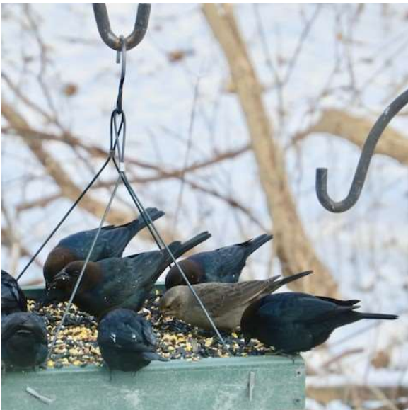
Brown-headed Cowbird Molothrus carolinus , Loch Highland, January 7 2022 (Cathy Theisen)

Often one of the earliest harbingers of spring, male Red-winged Blackbirds showed up remarkably early, with as eight of them at the Chelsea SGA on 1/12. Similarly, Brown-headed Cowbirds arrived locally in decent numbers during January as well – the largest group was one of 11 crowded onto a feeder near Dexter on 1/7. The first northbound Rusty Blackbird was noted at Waterworks Park on 2/21; additional Rusties were at McKinley and Island Lake Rd (4, on 2/25) and along Vreeland Rd (2, also on 2/25). Common Grackles remained into January at three sites, with two along Lodi Ln on 1/1 the maximum. After the parulid bonanza in the early winter period, only one species, the Yellow-rumped Warbler , remained into winter proper. Extending their good December showing, they were still being seen in six places during January, with an impressive three at Four Mile Lake on 1/23. Perhaps the cold snap during that month forced some of these birds south (or proved lethal), because numbers were much lower during February and likely involved the first northbound migrants, as evidenced by four at Waterworks Park on 2/21.