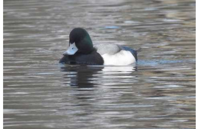
Greater Scaup Aythya marila , Arb-Gallup Bikepath, February 9 2022 (Nui Moreland)

On the rarer end of the Aythya spectrum, Canvasbacks were limited to a handful of locations along the Huron, with a few dozen as the maximum number present. Uncommon and not easy to separate from its more common congener, Greater Scaup were limited to small numbers (up to five) in a handful of locations along the Huron. Two Red-breasted Mergansers were among the multitudes of waterfowl in Furstenberg Park from 1/15 – 1/16; additional individuals were at Island Park (2/6) and Delhi Metropark (2/7). A hardy female Ruddy Duck shuttled between North Bay Park (1/22) and North Hydro Park (1/30 – 1/31); this bird was replaced by a male that frequented North Bay Park from 2/24 – 2/28.