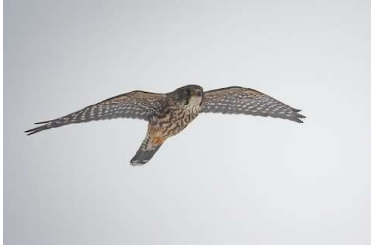
Merlin Falco columbarius, Vreeland & Gotfredson, January 24 2022

Like Sharp-shinned Hawks, Merlins had a banner winter season. During January, there were more than ten scattered all over the county, but that number had dropped by the time February rolled around – by then, only five sites still hosted these feisty little falcons. Two individuals at Gallup Park terrorized the local bird population there for some time. Away from their nesting location on U of M's Central Campus, Peregrine Falcons were at Domino's Farms (1/8), Dexter-Chelsea & Freer (1/14), and Wagner & Waters (1/26).