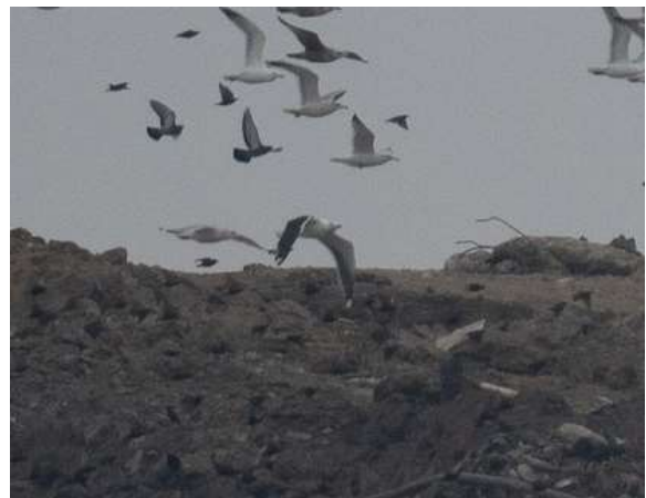
Greater Black-backed Gull Larus marinus , Salem Twp Landfill, January 18 2022 (Ben Lucking)

The occurrence of Turkey Vultures largely followed the pattern noted for Sandhill Cranes. During the first part of January, a few birds hung around here and there, but were pushed out by the mid-January cold. By the time February rolled around, numbers started building again and TUVUs were noted over dozens of locations. A sign of the species's continuing increase, there were a whopping 11 Bald Eagles around the Bridge Rd dam and North Hydro Park on 1/3, setting a new County high count. Throughout the period, about a dozen sites hosted up to three Northern Harriers . It appears to have been a very good winter season for Sharp-shinned Hawks , with dozens of locations hosting individual birds. The same held true for Red-shouldered Hawks : based on the spread of reports, there were likely some 15 individuals present in the County during January and February. Centered around