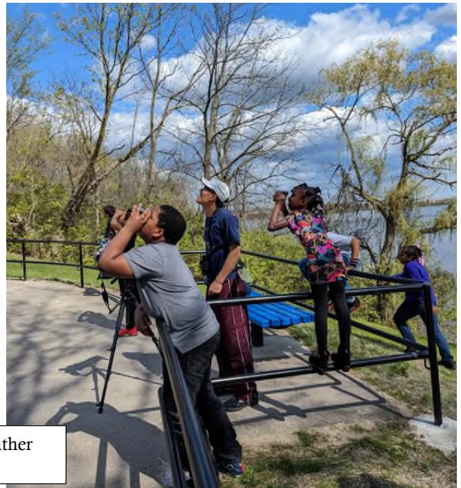
Looking for birds at Loonfeather Point Park

Library events continue to be another opportunity for educational outreach. On April 29, we held an event at the Downtown Ypsilanti library for families. We took a walk down the Water Street Trail and were treated to some wonderful birds. One picture shows the crowd looking at a Broad-winged Hawk perched over the river. That event concluded with the creation of some homemade bird feeders. A final event was a walk around the newly-constructed Ypsilanti library in Superior Township. We got to take a look at the bird-safe glass that Washtenaw Audubon made a contribution towards and took a walk around their beautiful habitat that was home to Yellow Warblers, Gray Catbirds, and Warbling Vireos.