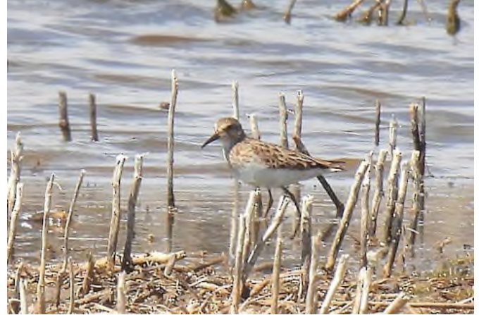
Least Sandpiper Calidris minutilla , Scio Church & Parker, April 11 2023 (Bill Nolting)

A couple of Dunlin appeared on 4/15: one was at Silver Lake, the other at the Meyer Preserve stayed until the next day. A very early Least Sandpiper stopped over at Scio Church & Parker from 4/11 – 4/14 – it was the only one during April. The same site was also the epicenter of what turned into an impressive gathering of Pectoral Sandpipers : starting 4/11, numbers built up to a whopping 200 birds on 4/16, although that multitude was fleeting and moved on that same day. Much smaller numbers were