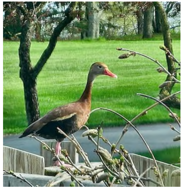
Black-bellied Whistling-Duck Dendrocygna autumnalis , Pleasant Lake & Ann Arbor Saline Rd, April 28 2023 (Kimberly Ellis)