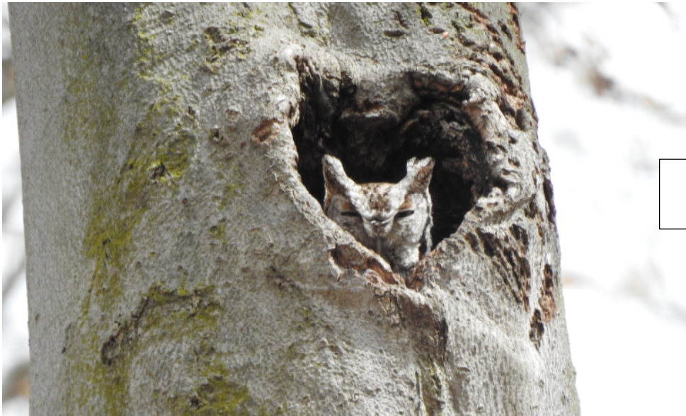
Eastern Screech-Owl (Jacco Gelderloos)

Fourteen wood-warbler species were present during April, but the majority of those did not arrive until the final week or so of the month. Of note were several Louisiana Waterthrushes : there was a very cooperative bird at Nichols Arboretum (4/6 – 4/10), a less reliable bird at Hewen's Creek Park (4/22 – 4/24), and one along Dexter Townhall Rd (4/30). The first of the spring's Northern Waterthrushes was found at Independence Lake on 4/23. Starting on 4/20, a mini-irruption of Orange-crowned Warblers took place: a WAS Thursday morning walk at Nichols Arboretum turned up the first on 4/20, then a second bird was found near Prospect & Ford the next day. The following day, two more were reported, from the Whitmore Lake Preserve and from Bandemer Park – the latter bird may well have been the same as the bird in the Arb a few days earlier. An early Cape May Warbler was at Gallup Park on 4/29.