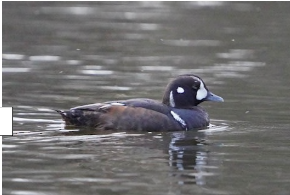
Harlequin Duck

Directions: Meet at the livery parking lot north of the wooden bridge near the entrance to Furstenberg.