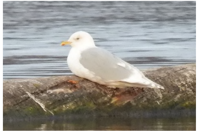
Iceland Gull Larus glaucooides , North Bay Park, March 23 2023 (Bill Nolting)

American White Pelicans continued their streak of spring occurrence in Washtenaw County when a flock of nine passed over Dolph Park on 4/2. Very hard to find due to its rather remote haunts, an American Bittern returned to its (likely) breeding territory at the Chelsea SGA, where it was heard booming on 4/24. The only Black-crowned Night-Heron of the period briefly stopped by the Argo Nature Area on 4/5.