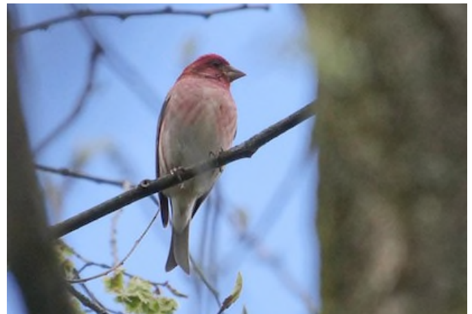
Purple Finch Haemorhous purpureus , Miller Nature Area, April 30 2023

Purple Finches continued to be quite widespread throughout, but they were not numerous in any way shape or form: the maximum group was just three. Even harder to come by were Pine Siskins : during March, the only observation was a bird attending a feeder on 3/4, while in April there were a mere handful of observations, all during the second half of the month, involving one or two birds. The last of the Vreeland Rd Lapland Longspurs were noted on 3/9 when a group of five was entered into eBird.