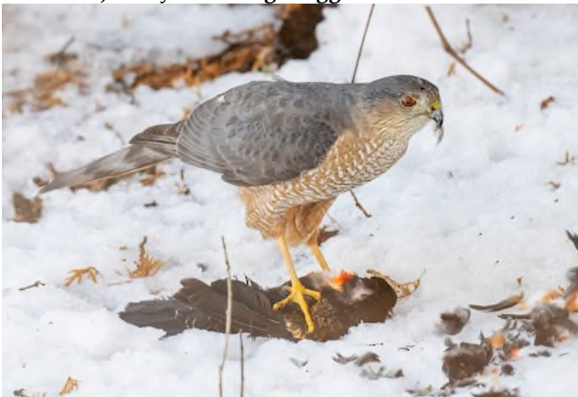
Sharp-shinned Hawk Accipiter striatus, Wildwood Lake, March 4 2023

Much like Bald Eagles, Ospreys continue to recover from their severe DDT-related decline, which was borne out by the large numbers moving through Washtenaw County starting in mid-March. Many, if not all, of the locally nesting pairs also settled back in. Migrating Northern Harriers put in quite the showing as well, with single birds over nearly twenty sites during March and April. Likewise, Sharp-shinned Hawks appeared to be everywhere, moving through one or two at a time – some of these birds settled in here and there, terrorizing the local songbird population in the process. Although the vast majority of the March-April Red-shouldered Hawks were northbound migrants, they have become a well-established part of our nesting avifauna, as is evident from the fact that several of the 20+ reported birds were long-staying and in appropriate habitat. Starting on 4/12, reports of small numbers of Broad-winged Hawks started coming in – pretty much every one of them involved lone birds (the maximum was nine birds). Only one Rough-legged Hawk was found – one was over Plymouth & US-23 on 3/4.