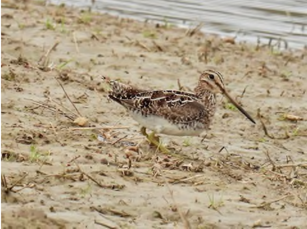
Wilson's Snipe Gallinago delicata , Meyer Preserve, April 16 2023 (Bonnie Penet)

found in a handful of other locations during the remaining two weeks of April. Wilson's Snipes had a banner spring migration window – starting on 3/25, they were reported from over 20 sites, with as many as 11 of them at Scio Church & Parker on 4/16. After two Iceland Gull reports from tail end of February, another (the same?) adult bird was found at North Bay on 3/23. A few days later, on 3/25, an adult Lesser Black-backed Gull , spent the day there as well. A gathering of gulls at Vreeland & Gottfredson contained one (4/14), then up to four (4/16) Lesser Black-backed Gulls . The only Caspian Tern of the early spring period was over Wildwood Lake on 4/24 – this species tends to be more common in later summer locally. Notoriously ephemeral, a Forster's Tern made a very brief appearance over Scio Church & Parker on 4/15, where it surprised a fortunate handful of birders.