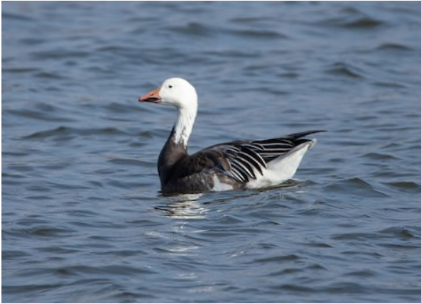
Snow Goose Anser caerulescens , Ford Lake Park, March 1 2023

The Ypsilanti Township blue morph Snow Goose continued its peregrinations there, being noted at Ford Lake Park on 3/1 and at Hewen's Creek Park (on 3/18). A duo of white morph Snow Geese frequented the area around a pond along Ridge Rd, just north of Geddes, occasionally venturing out into the field along Vreeland and Gotfredson Rds. A rather large mixed flock of five blue and two white morph birds was present at the Schneider Rd Pond (3/15 – 3/28). Single white morph Snow Geese were seen at the Stonebridge ponds (3/19) and North Bay Park (3/24). Single Cackling Geese were at Thurston Pond on 3/1 and at Gallup Park on 3/19. The bulk of the northbound Tundra Swan migration over Washtenaw County petered out during the first week of March with several double-digit flocks. A few lingering birds (1 to 3) stayed into early April.