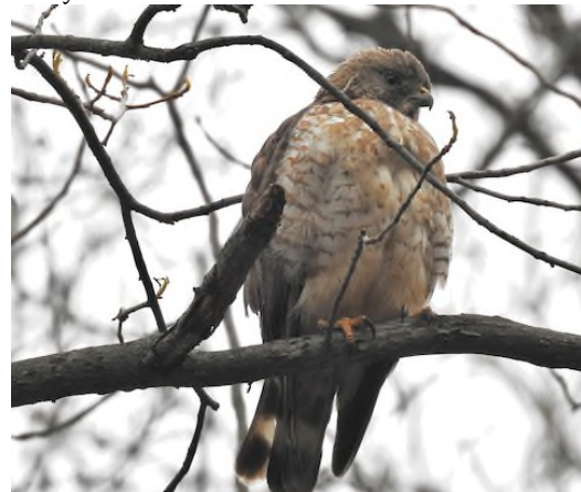
Broad-winged Hawk Buteo platypterus, Mary Beth Doyle Park, April 24 2023

As mentioned in the previous rarity report, Barred Owls are steadily expanding their range in Washtenaw County eastward. One or two of these attractive owls were present in some 15 locations throughout March-April. A Northern Saw-whet Owl was one-day wonder in a yard at Tubbs & Huron River Dr on 3/30. Red-headed Woodpeckers started trickling back into Washtenaw