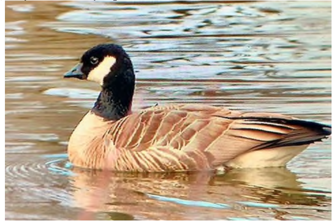
Cackling Goose Branta hutchinsii , Thurston Pond, March 1 2023 (Jim Law)

Good numbers of Northern Pintails stayed around into early April; the maximum was a group of 14 along Hack Rd on 3/16. After a rather paltry showing in the previous period, Canvasback numbers increased quite significantly – up to 30 birds were present on eight different lakes. The same pattern held true for Greater Scaup with as many as two dozen of them at seven or eight bodies of water. The early spring period was also quite good for Red-breasted Mergansers with birds seen on a whopping nine lakes – Whitmore Lake was the epicenter for this bonanza when as many as 40 were seen there on 4/5.