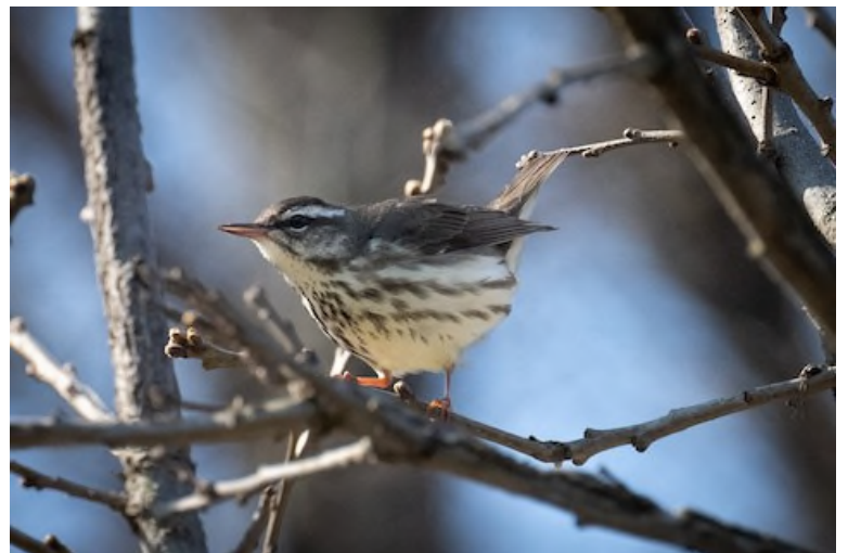
Louisiana Waterthrush Seiurus motacilla, Nichols Arboretum, April 8 2023