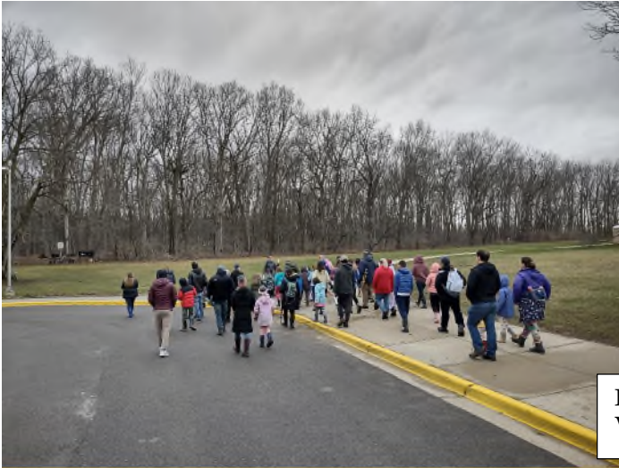
Heading into Scarlett-Mitchell Woods

April and May were busy but exciting times for educational opportunities. On April 1, we held a special bird walk for participants of the Washtenaw Elementary Science Olympiad (WESO) Feathered Friends competition. This event has 2nd through 5th graders learning about the birds of Michigan and tries to get them interested in birding. Although the bird walk was cut short by weather, we had over 40 students and parents come out to walk through Scarlett-Mitchell Nature Area.