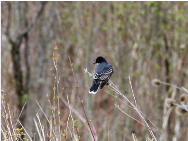
Eastern Kingbird Tyrannus tyrannus , LeFurge Woods, April 22 2023 (Wendy Conrad)

An odd-ball Gray Catbird was at Joy & Earhart on 3/23 and made for the only report prior to May. There were five clusters of Northern Mockingbird reports: at Waterworks Park in Ypsilanti (3/29), at three different sites around Ann Arbor (4/5 - 4/26), in the Manchester area (4/15 - 4/18), at two spots near Whitmore Lake (4/15 - 4/30), and two more just south of Saline (4/16 - 4/28). An early-ish Swainson's Thrush was at Nichols Arboretum on 4/30. More expected was the arrival of a handful of Wood Thrushes as of 4/23.