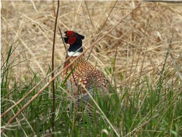
Ring-necked Pheasant Phasianus colchicus, Weber Rd, April 29 2023

Ring-necked Pheasants bucked the recent trend of near-absence and were well-represented throughout the county this March-April. As many as six of them were at the Chelsea SGA on 4/26 and reports of this introduced gamebird came in from well over a dozen different sites all over the county. By contrast, there were no Ruffed Grouse observations at all; since March-April is the time frame when drumming males tend to be most readily found, this is very concerning for the continued viability of this species' local population. Two Common Gallinules were back at the fluddle at M-52 & Lehman (4/24 – 4/26), where they were often very hard to see while they spent significant time in the vegetation lining the water.