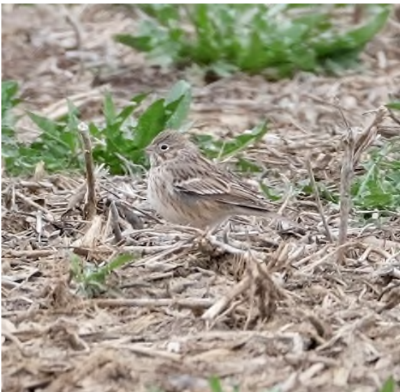
Vesper Sparrow Pooecetes gramineus , Vreeland Rd, April 18 2023 (Cherie F)

Purple Finches continued to be quite widespread throughout, but they were not numerous in any way shape or form: the maximum group was just three. Even harder to come by were Pine Siskins : during March, the only observation was a bird attending a feeder on 3/4, while in April there were a mere handful of observations, all during the second half of the month, involving one or two birds. The last of the Vreeland Rd Lapland Longspurs were noted on 3/9 when a group of five was entered into eBird.