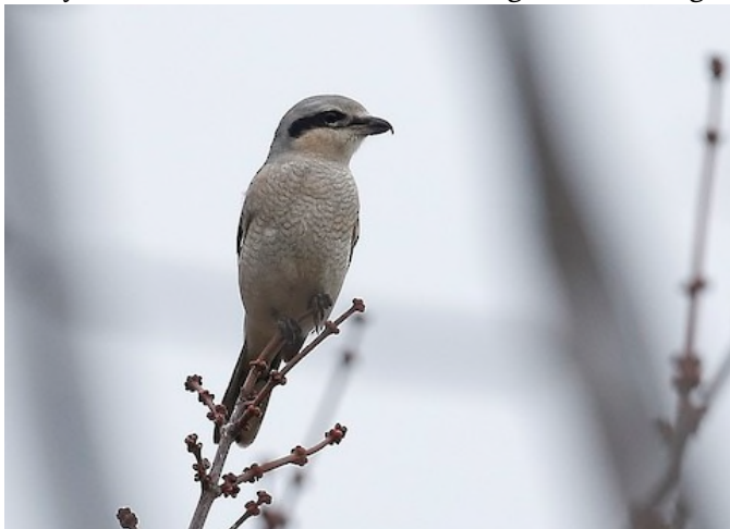
Northern Shrike Lanius borealis , Domino's Farms, October 25 2023

Rarely reported during the fall, Acadian Flycatcher reports came in from five sites, all during the first week of September. Philadelphia Vireos had a banner fall migration window, with birds at over 20 sites through the first week of October. Even more strikingly, a staggering 7 (!) birds were at the Cherry Hill Nature Preserve on 9/10, setting a new high mark for Washtenaw County. For the intrepid birders venturing into the Chelsea SGA during the second half of October, there was a fine reward in the form of Northern Shrike(s) , which was present 10/22 – 10/26. Incredibly, three different individuals were seen on 10/22, which is highly unusual for this usually solitary species. Another shrike was at much more easily accessible Domino's Farms for a couple of days, from 10/24 – 10/25. Up to four Sedge Wrens remained in the sedge fields of the Chelsea SGA, where they were seen through 10/19. As was the case over the summer, Marsh Wrens were more easily found and remained in at least eight sites through 10/15.