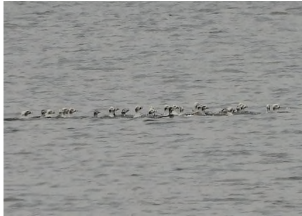
Long-tailed Duck Clangula hyemalis , Whitmore Lake, October 21 2023

A few Ring-necked Pheasants , all involving one or two birds, were seen in about half a dozen locations spread around the County. Although Silver Lake is not renowned for the abundance of waterfowl that can be found there, especially when compared to nearby Portage Lake, several lucky observers witnessed a rather extraordinary gathering of Red-necked Grebes there on 10/16 – the group of seven birds more than the previous high count of three! Both cuckoo species were noted into the final week of September, with the last of the Yellow-billed Cuckoos seen on 9/26 and the last Black-billed Cuckoo noted a few days later on 9/29.