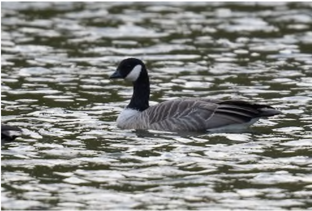
Cackling Goose Branta hutchinsii , Mill Pond Park, October 18 2023