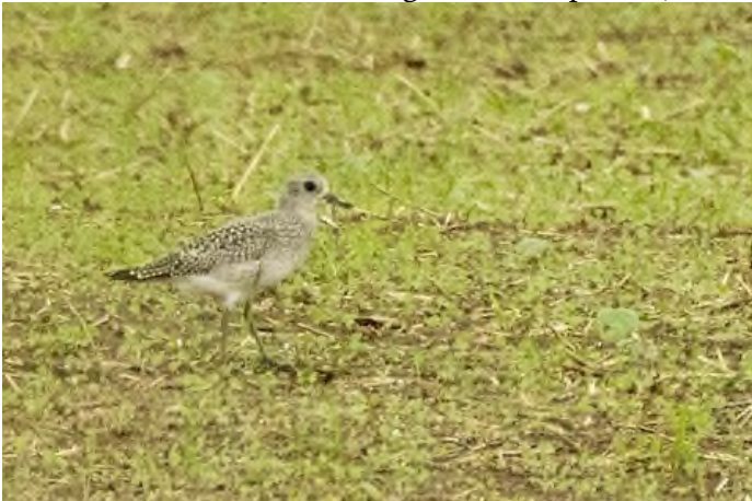
Black-bellied Plover Pluvialis squatarola, Hieber & Reno, September 12 2023

Finding either of the two Pluvialis plovers involves scouring harvested and plowed agricultural fields, often with a relatively limited return on time investment. It did, however, pay off on 9/11 when a Black-bellied Plover was found among the masses of Killdeer at Reno & Hieber. This bird continued in this field until the next day, but then moved on. That day, 9/12, a pair of American Golden-Plovers was found among the plowed furrows in a field along Braun, near Lima Center. Subsequently, another Golden-Plover was seen at Four Mile Lake on 9/19 and yet another one was at Judd & Stony Creek. A wetland on Vreeland Rd hosted up to eight Semipalmated Plovers from 9/14 – 9/10, with an additional two at Four Mile Lake from 9/8 – 9/12. A good fall for plovers, all in all.