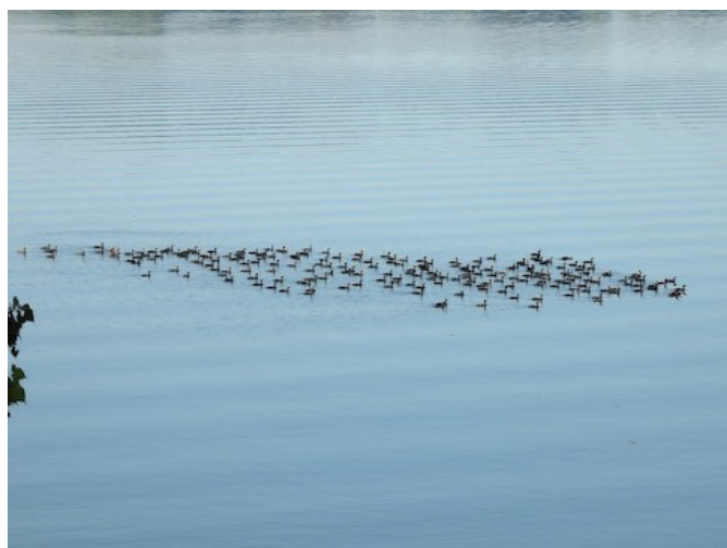
Double-crested Cormorant Nannopterum auritum , Loonfeather Point Park, October 3 2023

October is peak migration season for Turkey Vultures ; although the bulk of southbound vultures move through at the hawk watching sites on Lake Erie, some impressive numbers can be observed locally as well. On 10/22, steady stream was seen over LeFurge Woods, adding up to at least 262 individuals, which set a new record high tally. The next day, on 10/23, the Torrey Rd hawk watch site lived up to its growing reputation as the best place to see Golden Eagles in Washtenaw County, when four of them were seen on their way south. Migrating Northern Harriers moved through throughout the fall, but reports persisted of birds in the Vreeland & Prospect area, lending further fodder to the idea that this species may have attempted nesting there. October 23 was clearly a great day to be at Torrey Rd, because in addition to the Golden Eagles mentioned above, a record number of 37 Sharp-shinned Hawks moved by. In addition to our more or less resident population, migrating Red-shouldered Hawks moved through in good numbers – between 1 and 3 were seen at or over some dozen and half spots. Similarly, Broad-winged Hawks were present widely, although in most of these cases observations involved southbound birds. Most reports involved singles or small numbers, but there was a rather staggering tally of 1,200 birds over Hewitt & Clark on 9/16. Early-ish Rough-legged Hawks were seen over the DeVine Preserve on 10/22 and the Cedar Lake Campground on 10/24.