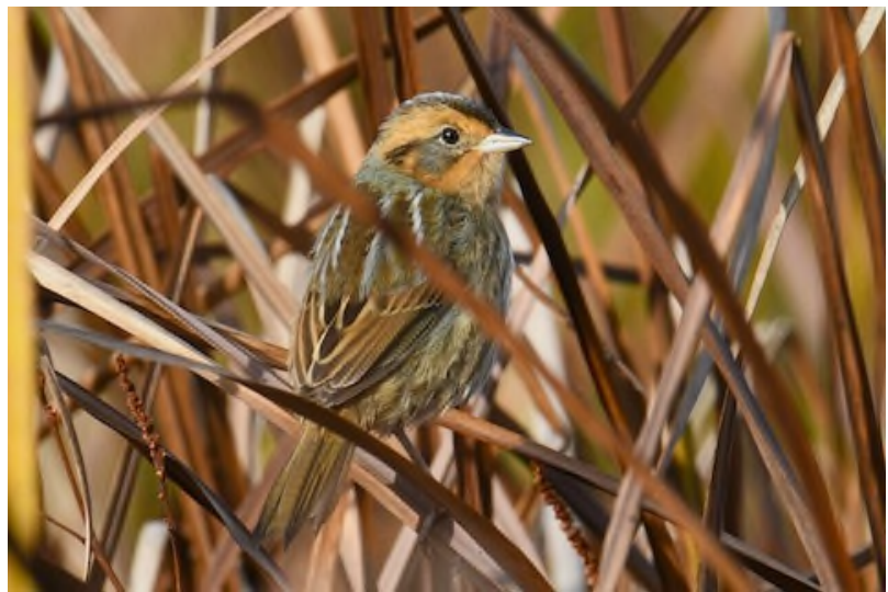
Nelson's Sparrow Ammodramus nelsoni , Chelsea SGA, October 21 2023 (Nolan Williams)

A total of 26 parulid warbler species were observed during fall of 2023. Single Golden-winged Warblers were noted in five different locations during a relatively narrow window, from 9/6 – 9/17. Roughly during that time, three Blue-winged Warblers passed through from 9/10 – 9/20. On 10/6 a very late male Brewster's Warbler hybrid was seen briefly at Four Mile Lake – this represents only the second October record for Michigan and only the fourth for the Great Lakes region.