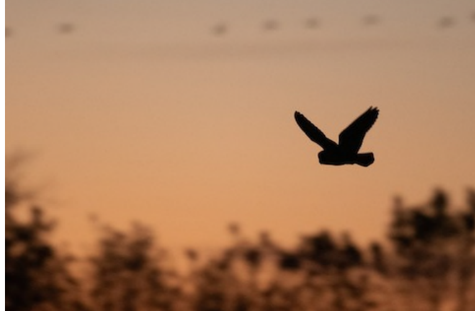
Short-eared Owl Asio flammeus , Chelsea SGA, October 22 2023 (Ben Lucking)