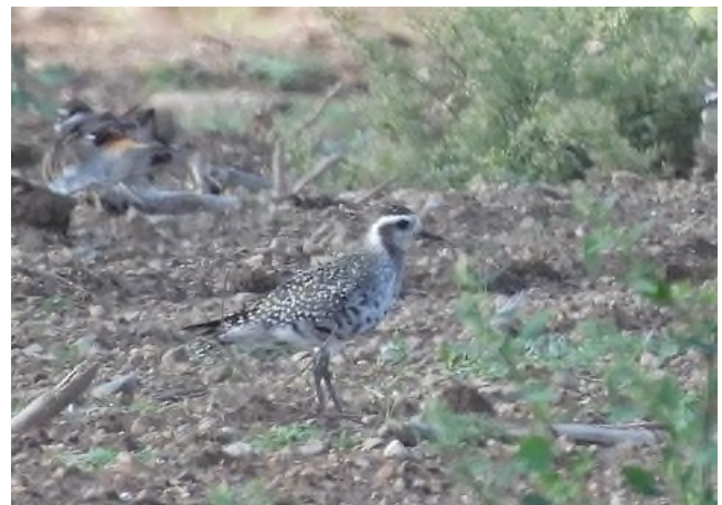
American Golden-Plover Pluvialis dominica, Braun & Lima Center, September 12 2023