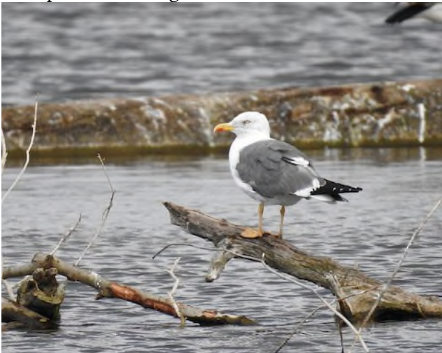
Lesser Black-backed Gull Larus fuscus , North Bay Park, September 24 2023 (Nui Moreland)

The fact that large groups of Double-crested Cormorants congregate on Ford Lake in the early fall months is nothing new, but a group of over 200 birds most definitely is noteworthy – on 10/3, 206 of them were counted from Loonfeather Point Park, establishing a new record high count for Washtenaw County. Black-crowned Night-Heron were quite widespread this fall. Single birds were at North Bay Park (9/1 – 9/24), the Matthaei Botanical Gardens (9/6), Wilderness Park (9/30), and Ford Lake (10/16). Not surprisingly, given the location's go-to status for observing this species, the largest concentration was at Mary Beth Doyle Park, where a record high group of six birds of varying ages were observed on 9/13. Some of these birds persisted through at least 10/21.