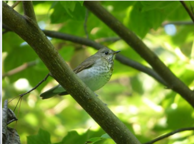
Gray-cheeked Thrush Catharus minimus , Nichols Arboretum, September 13 2023