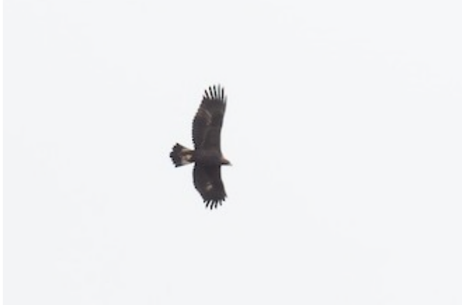
Golden Eagle Aquila chrysaetos , Torrey Rd Hawk Watch, October 23 2023 (Ben Lucking)

Red-headed Woodpeckers extended their excellent run of form from the summer and continued at more than 20 locations – the summertime high of nine was beaten out by a record number of ten birds at the Leonard Preserve on 9/9. The seven Hairy Woodpeckers at the Cedar Lake Campground on 9/12 established a new high count. Participants in this year's Big Sit event at Independence Lake on 10/7, saw four Merlins migrating south, which established yet another high count for this fall. Away from downtown Ann Arbor, Peregrine Falcons were at Textile & Zeeb (9/8), over Independence Lake (10/7), and at the Matthaei Botanical Gardens (10/8).