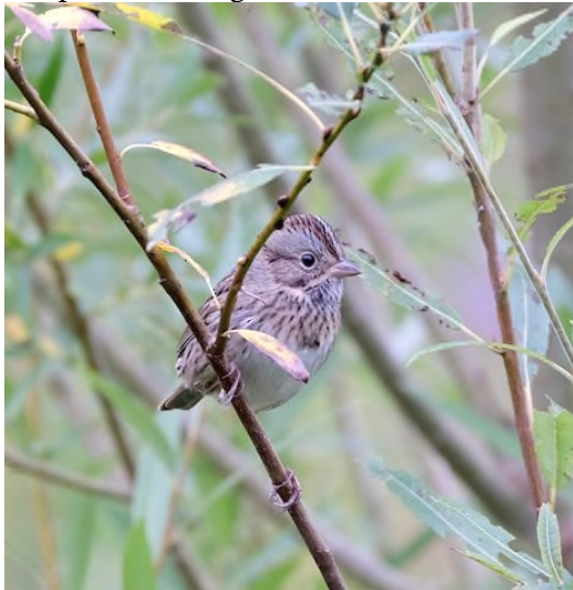
Lincoln's Sparrow Melospiza lincolnii , Matthaei Botanical Gardens, September 26 2023 (Cherie F)

After being absent in September, quite surprisingly four different Clay-colored Sparrows were found in October: one at the DeVine Preserve (10/8), two at the Matthaei Botanical Gardens (10/8), and one at the Conservancy Farm (10/9). The only Vesper Sparrow was at Braun & Jordan on 9/4. The clear highlight in the sparrow category this fall was the presence of up to three Nelson's Sparrows in the sedge field of the Chelsea SGA from 10/19 – 10/23, establishing yet another count high count. Combined with their occasional presence at the restricted access property at Vreeland & Prospect, these handsome little sparrows may well be annual visitors to Washtenaw County. Perhaps because they are overlooked or dismissed as the more common Song Sparrow, Lincoln's Sparrows seemed unusually widely reported this fall. Not only were they present in over 30 locations, but many of them hosted multiple (up to four) birds. Rounding out the abundance of local high counts was a staggering tally of 75 Swamp Sparrows at, where else, the Chelsea SGA/Four Mile Lake – that site was clearly the hotspot for birding this fall!